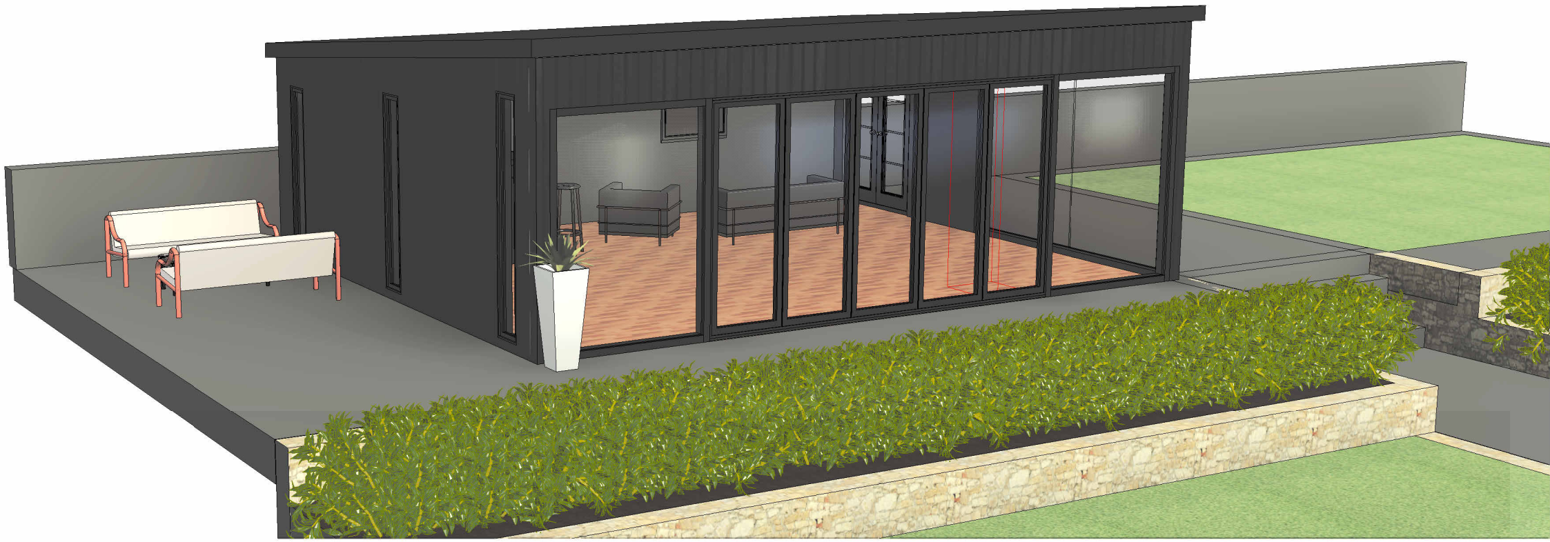
2 3D View 2