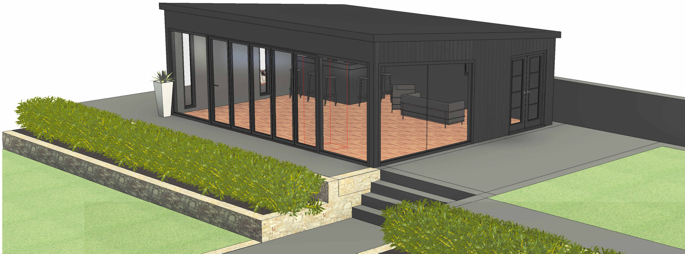
1 3D View 1