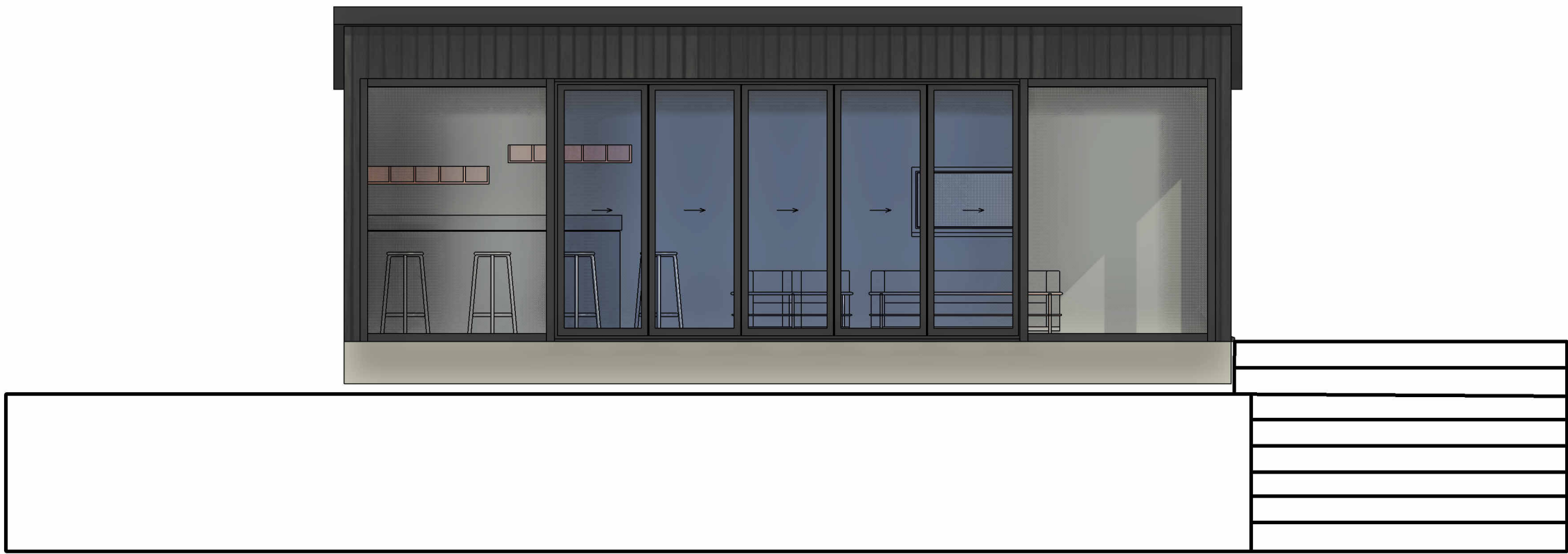
5 EXISTING SOUTH 1 : 50