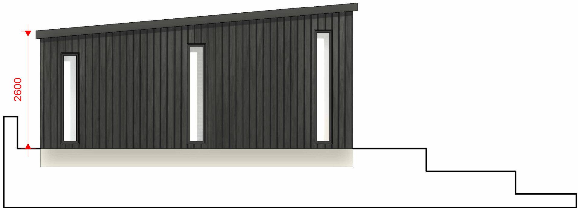
6 EXISTING WEST 1 : 50