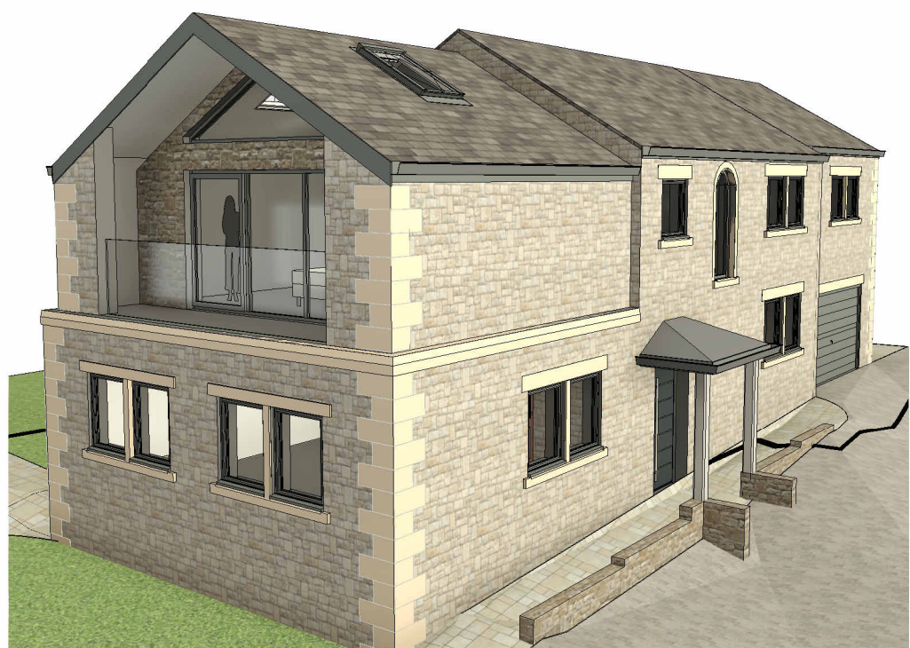
5 Visual 1