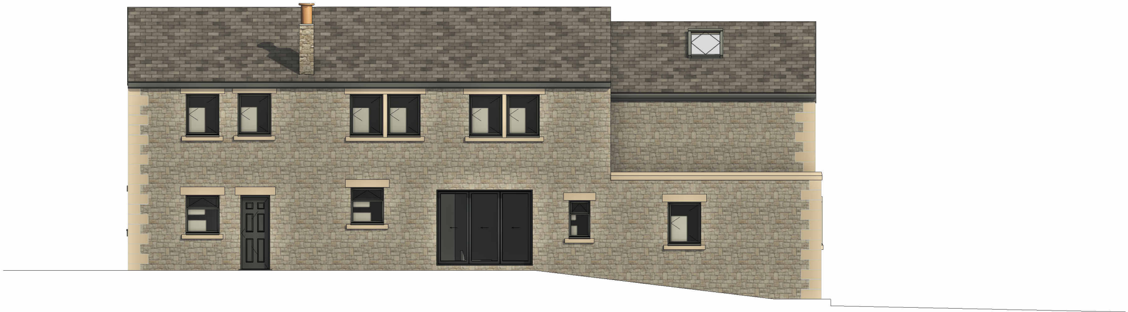
4 Proposed North East 1 : 100