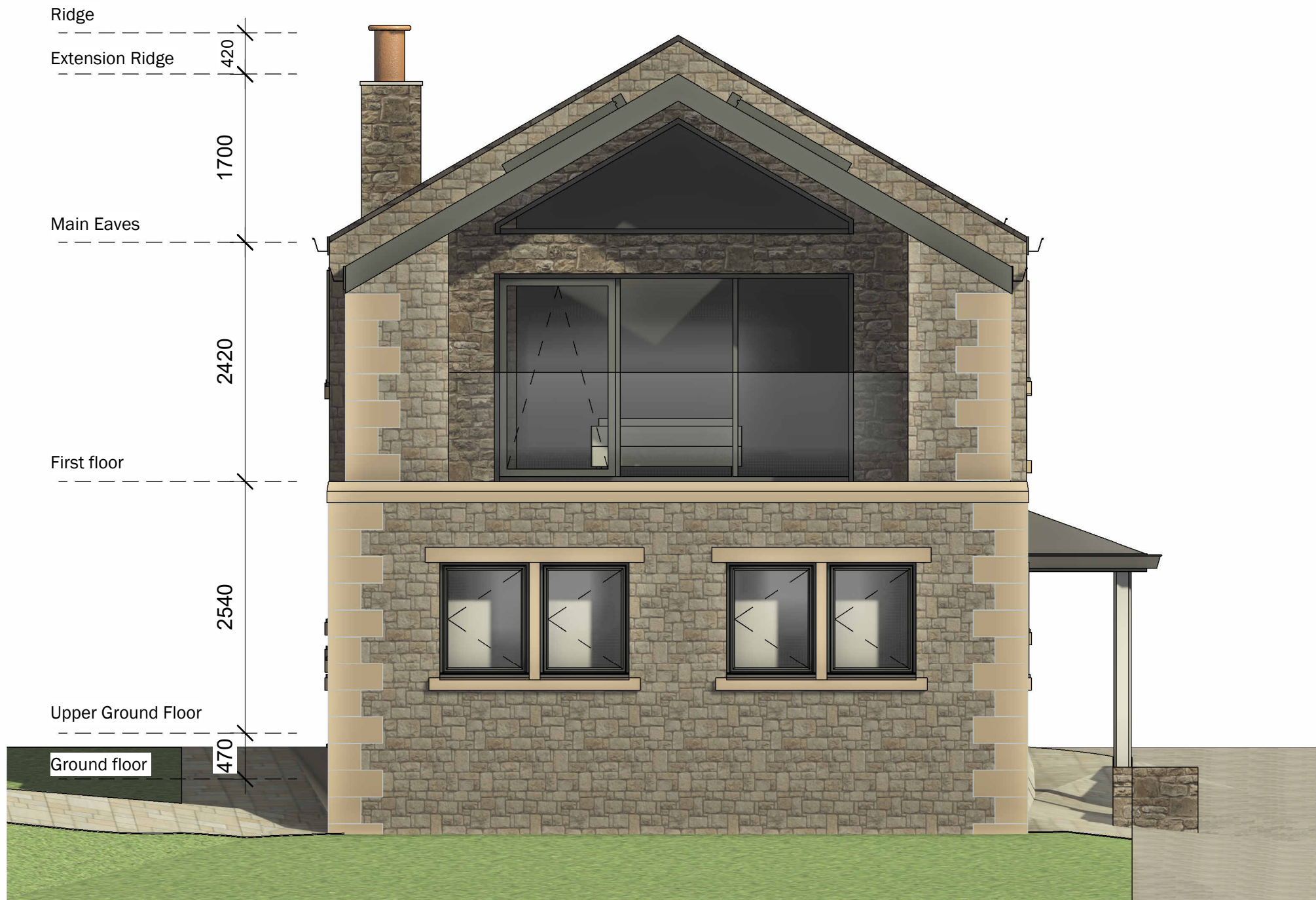
2 Proposed North West 1 : 50