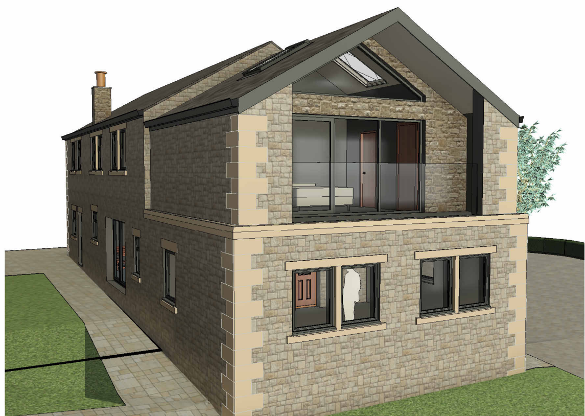
6 Visual 2