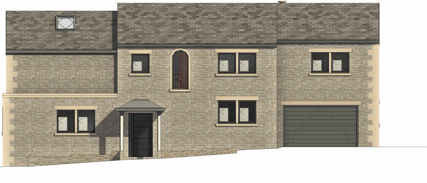
3 Proposed South West 1 : 100