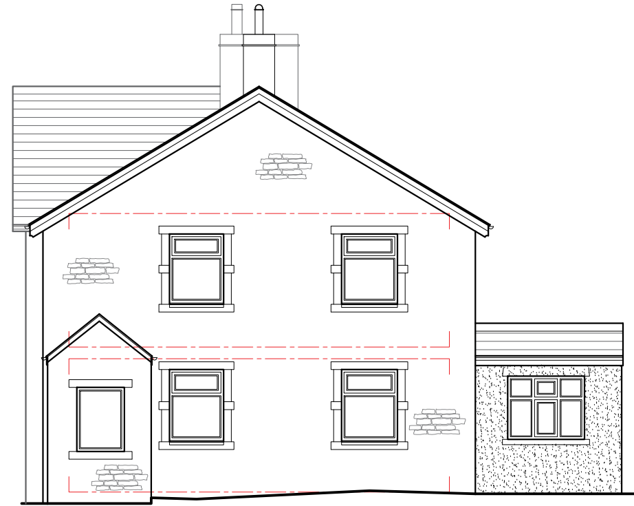
Existing South East Facing Elevation Scale 1:100