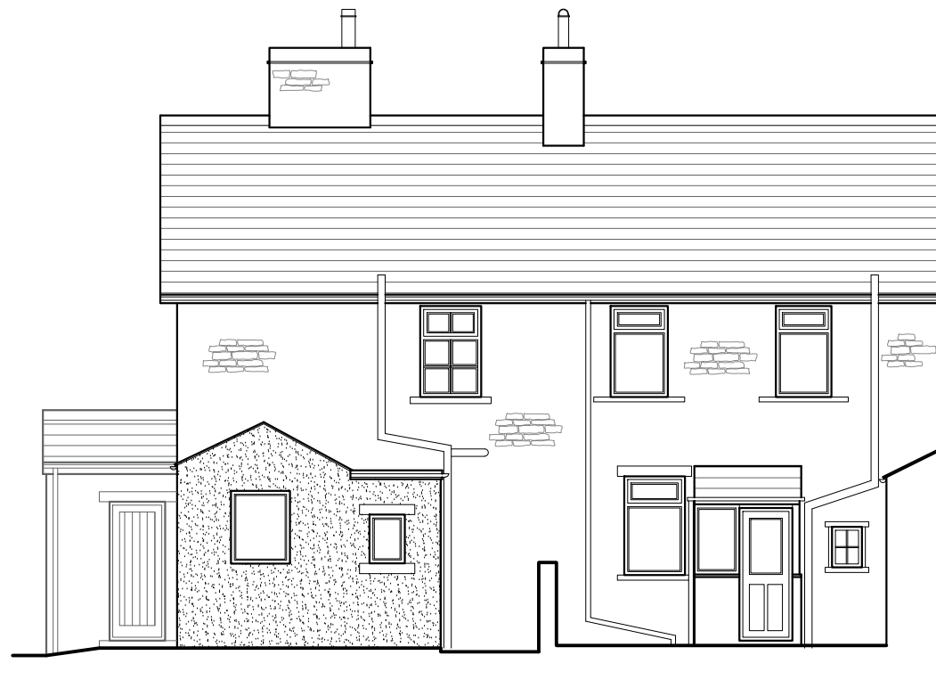
Existing North East Facing Elevation Scale 1:100