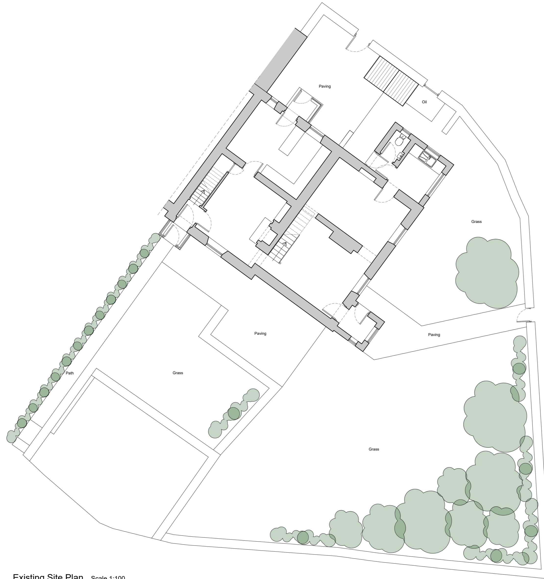
Existing Site Plan Scale 1:100