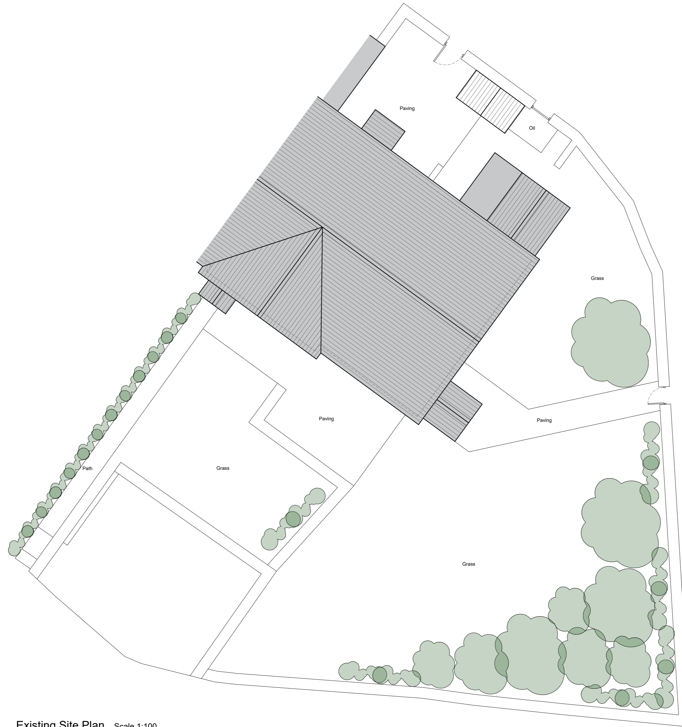
Existing Site Plan Scale 1:100