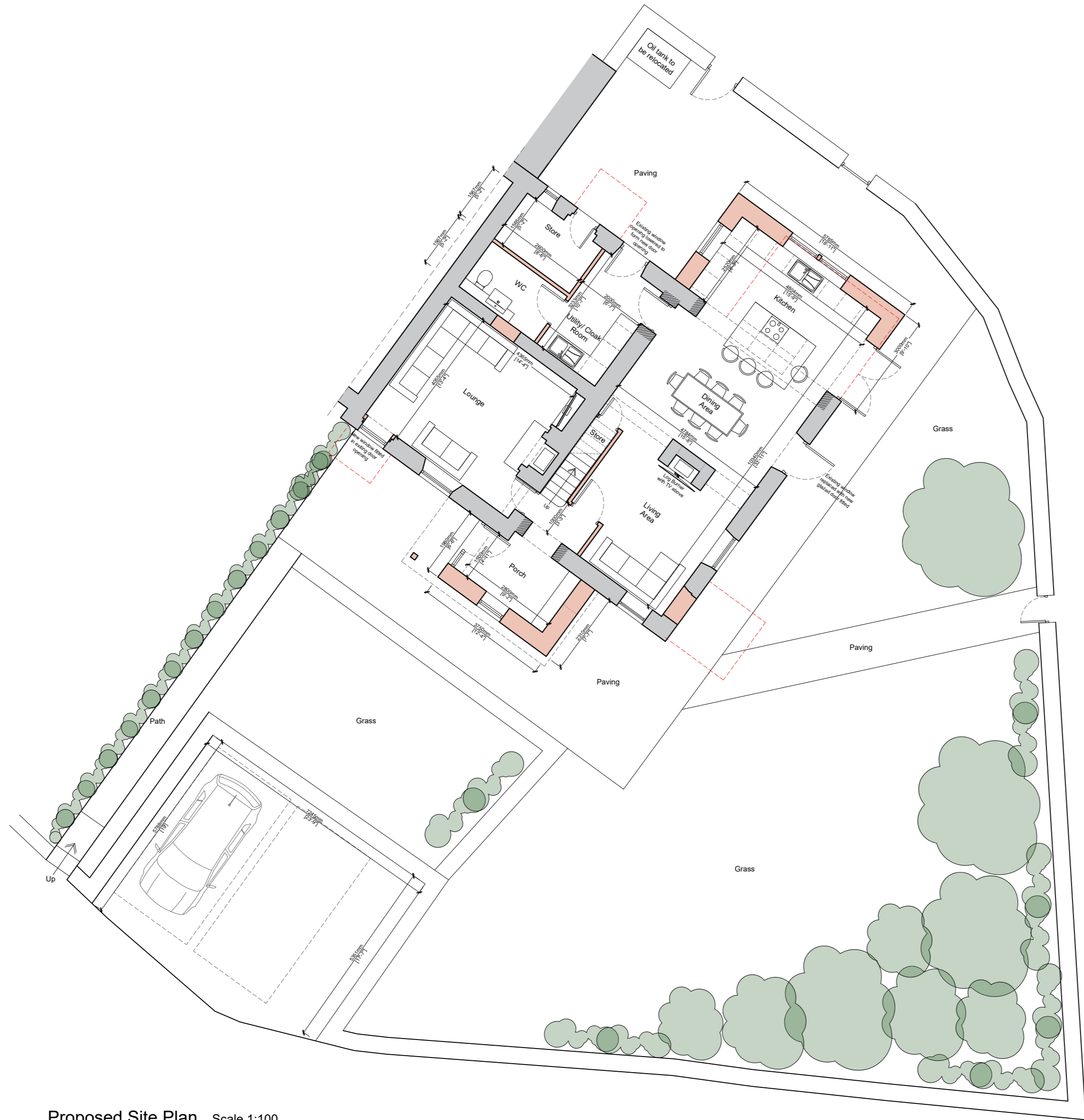
Proposed Site Plan Scale 1:100