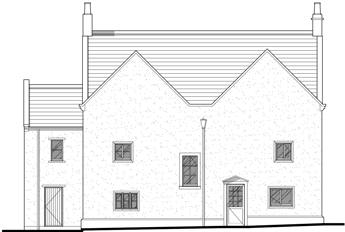
EXISTING REAR NORTH FACING ELEVATION SCALE: 1:100

This drawing is to be read in conjunction with all relevant Architect, consultants' and specialists' drawings and specifications. The Architect is to be notified of any discrepancies before proceeding. Do not scale from this drawing. All dimensions and levels are to be checked on site. This drawing is subject to copyright. All work carried out before Planning and Building Permission has been granted is at the contractor/clients risk. Unless indicated, this drawing is for information only. Sunderland Peacock and Associates Ltd. accepts no liability for use of this drawing by parties other than the party for whom it was prepared or for purposes other than those for which it was prepared. Do not scale from this drawing. All dimensions to be checked prior to work commencing on site.