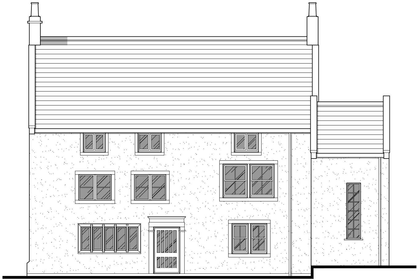
EXISTING FRONT SOUTH FACING ELEVATION SCALE: 1:100