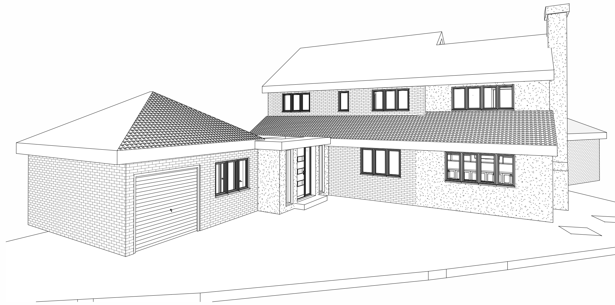
1 3D View