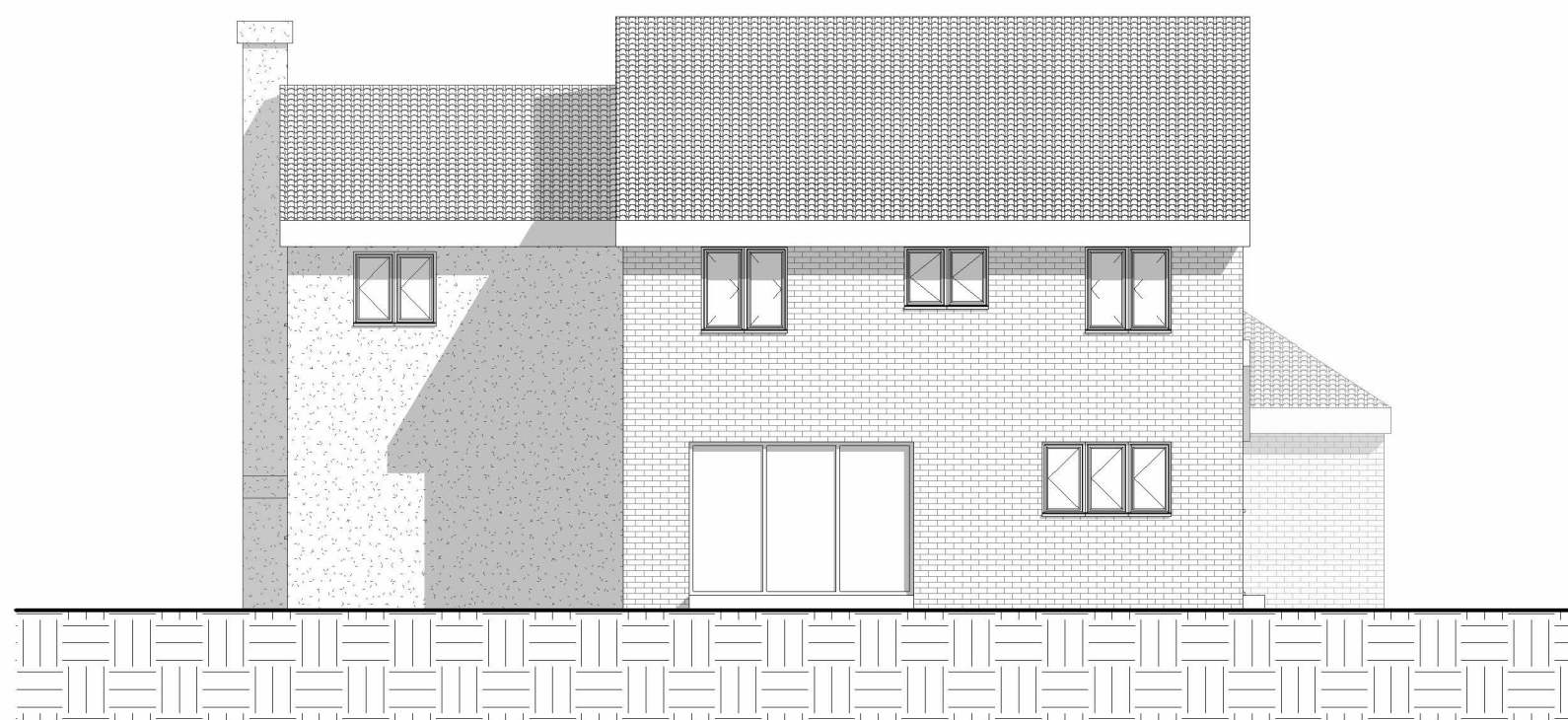
4 PROPOSED SOUTH 1 : 100