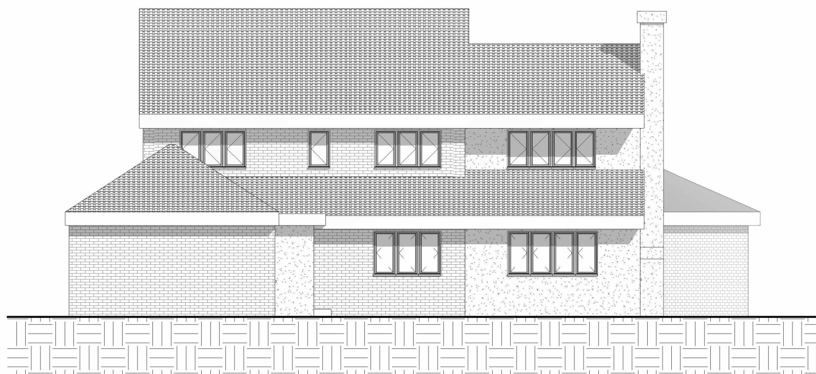
2 PROPOSED NORTH 1 : 100