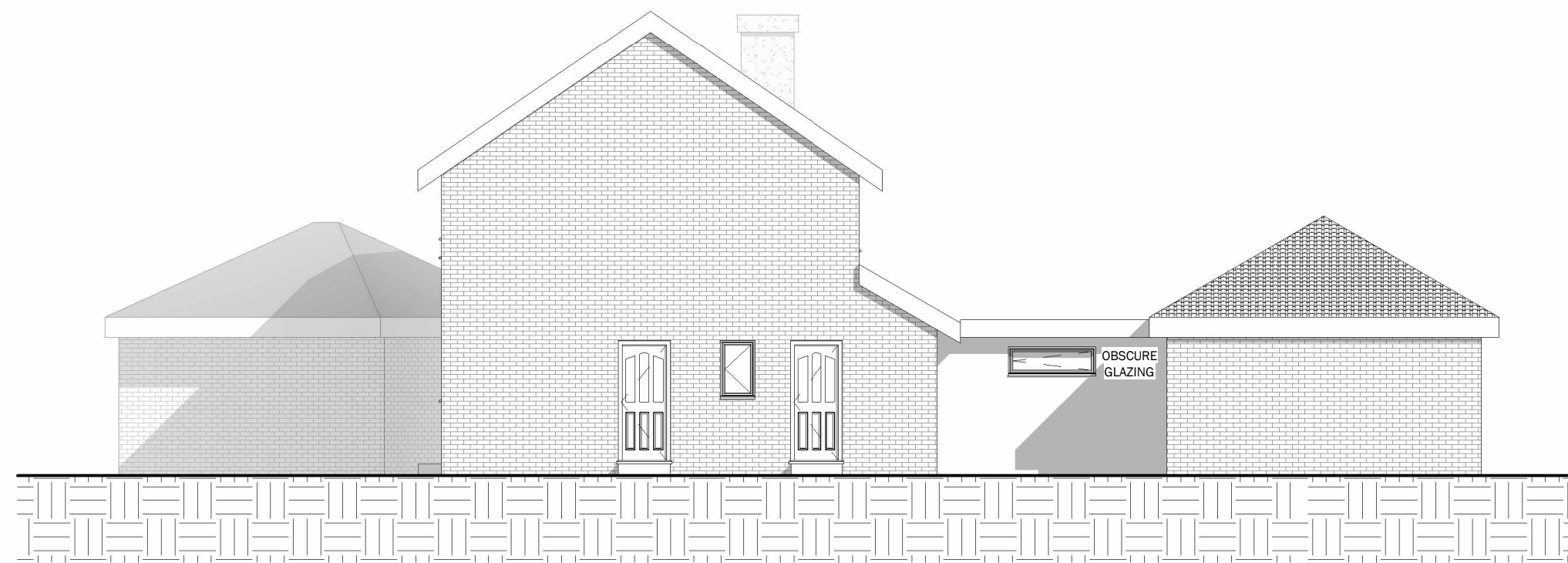
3 PROPOSED EAST 1 : 100