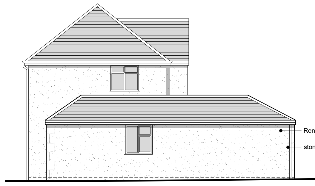
PROPOSED EAST ELEVATION Scale 1:100