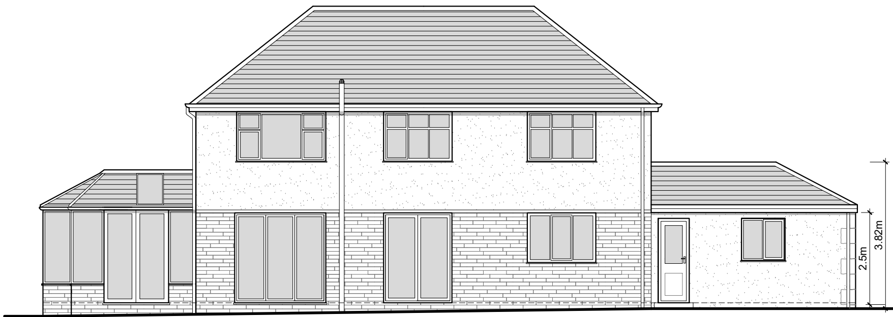
PROPOSED SOUTH ELEVATION Scale 1:100