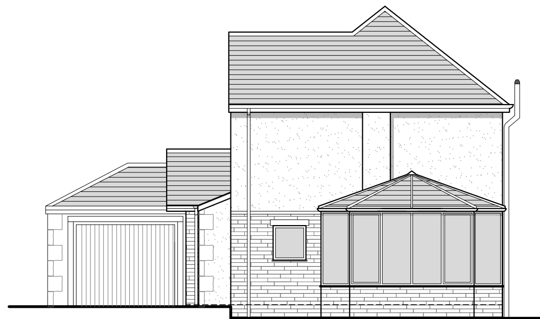
PROPOSED WEST ELEVATION Scale 1:100