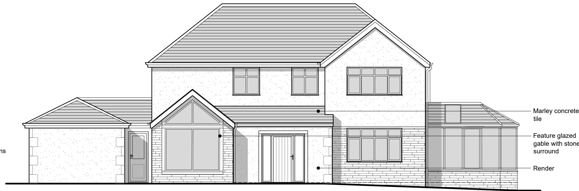
PROPOSED NORTH ELEVATION Scale 1:100