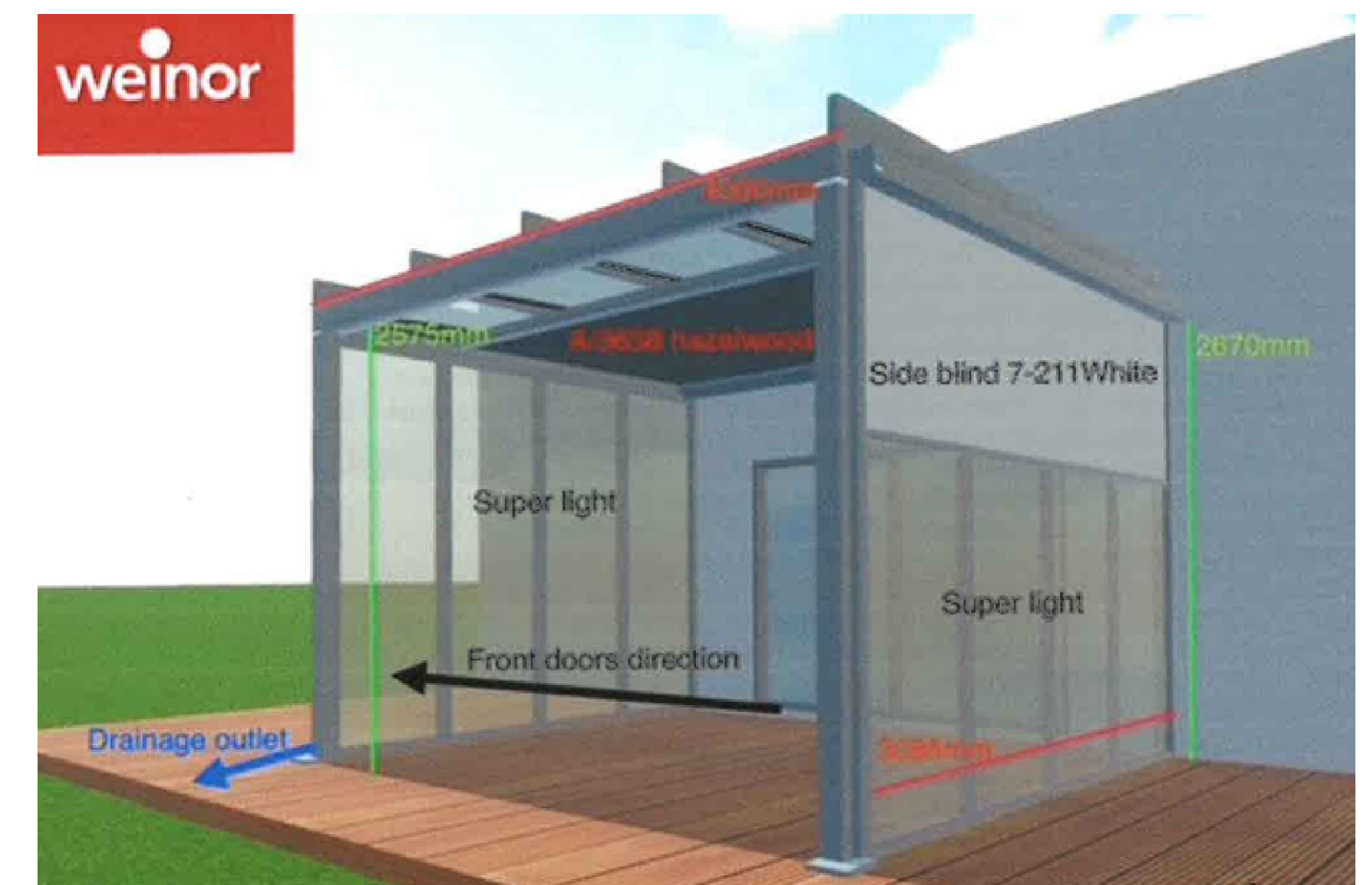
Manufacturers Indicative Visual of Proposed Extension NTS