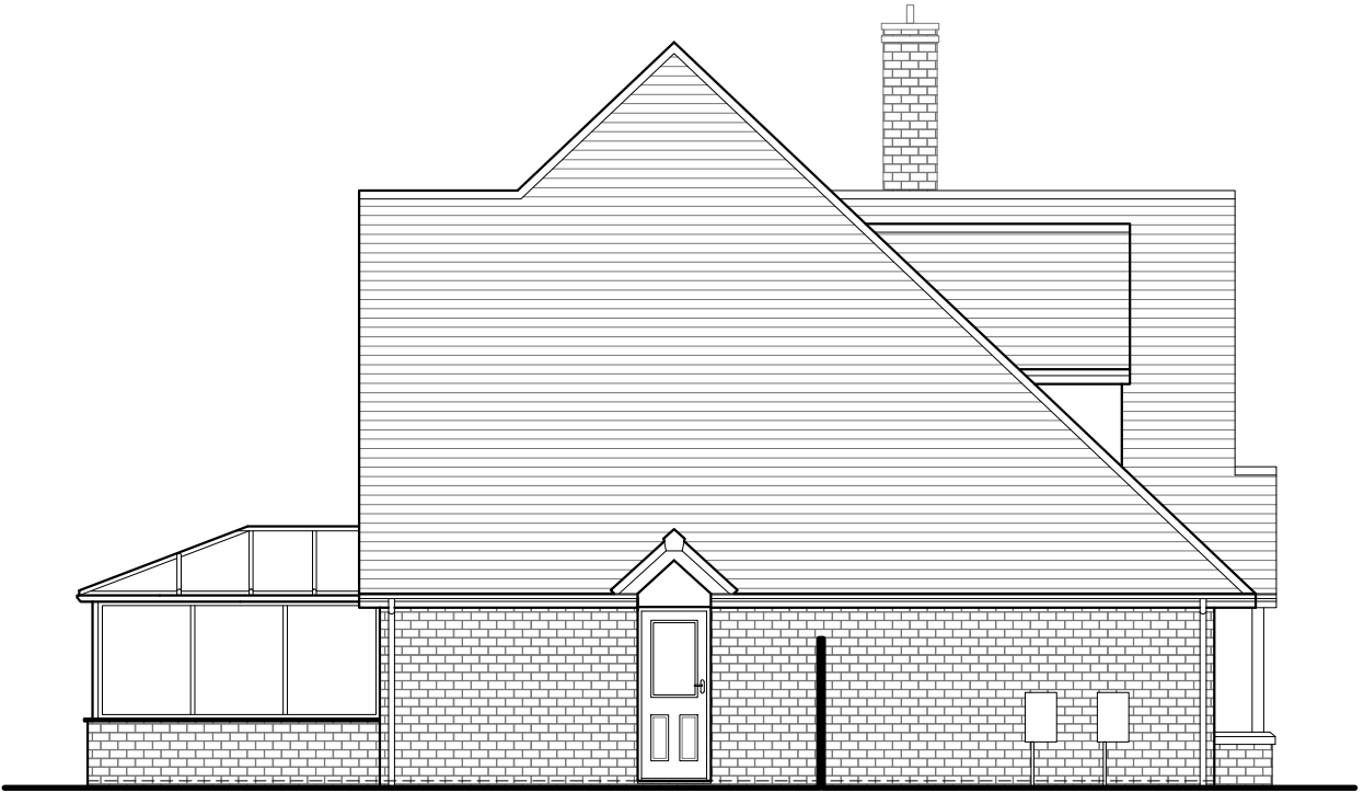
EXISTING SOUTH ELEVATION Scale 1:100