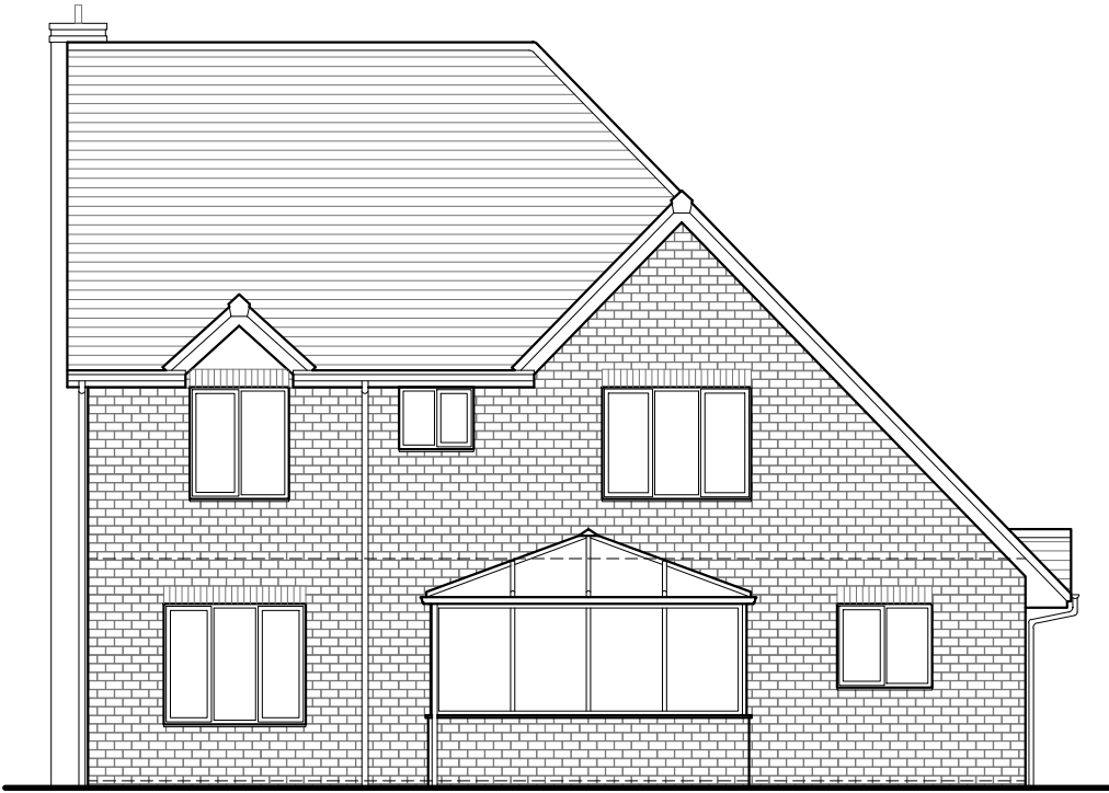
EXISTING WEST ELEVATION Scale 1:100