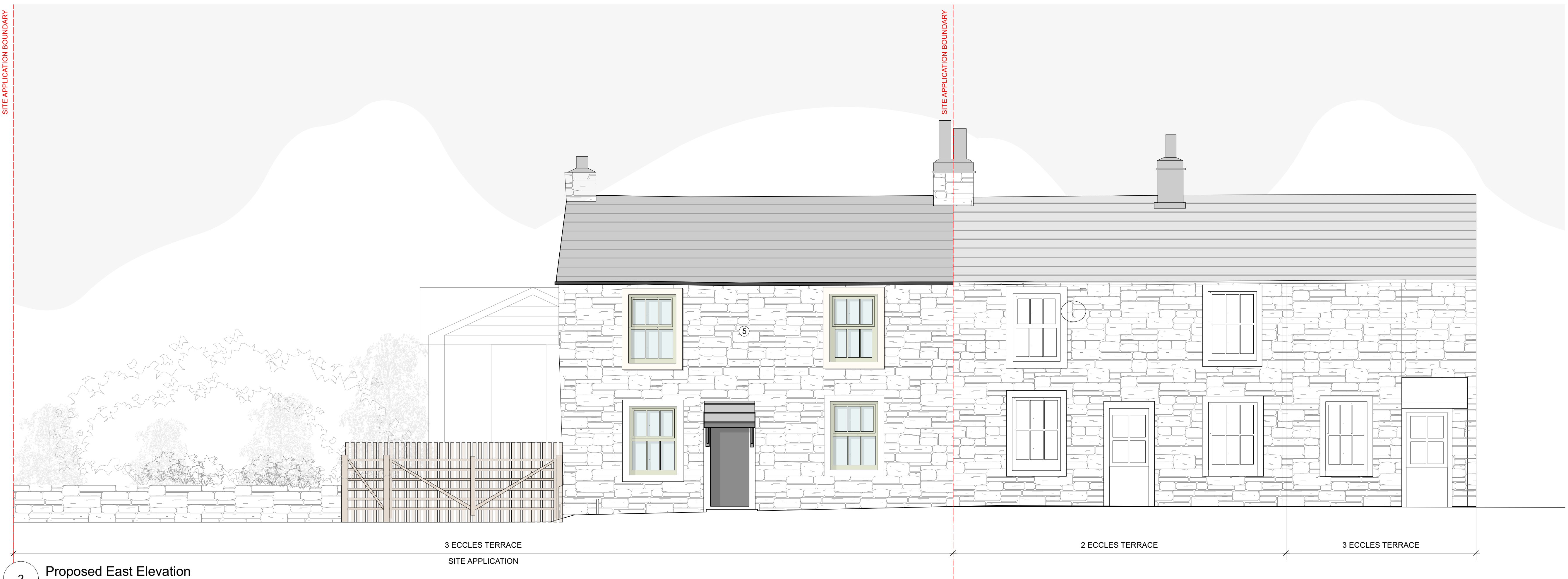
2 Proposed East Elevation Scale: 1:50