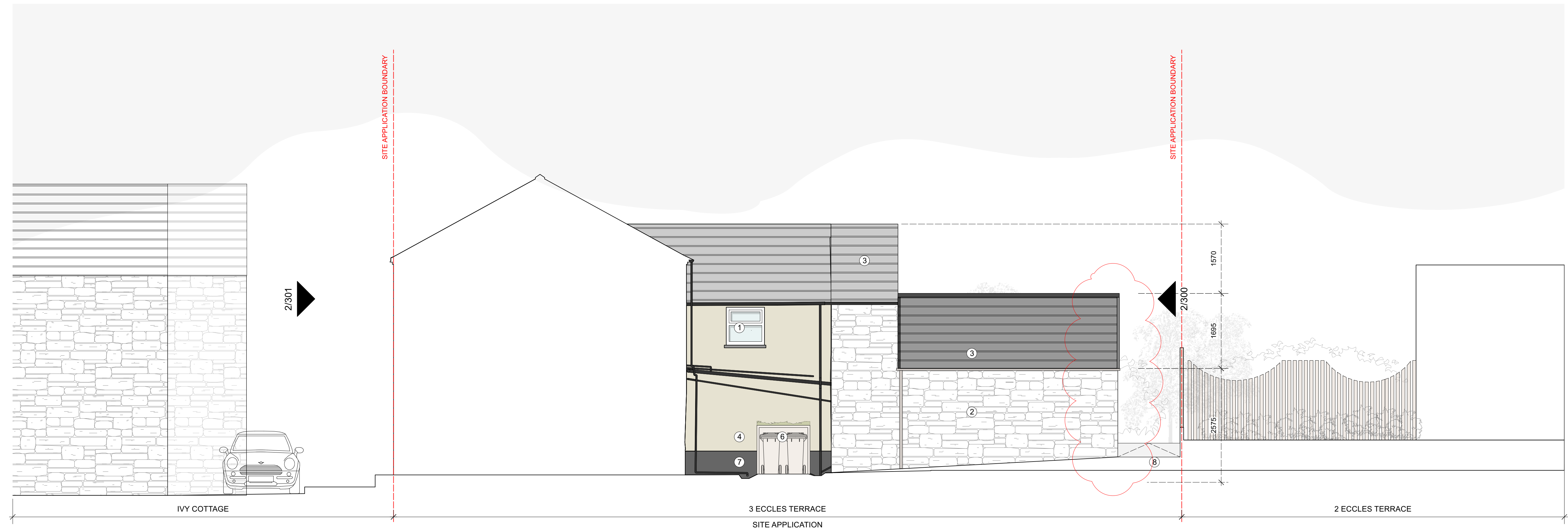
1 Proposed North Elevation Scale: 1:50