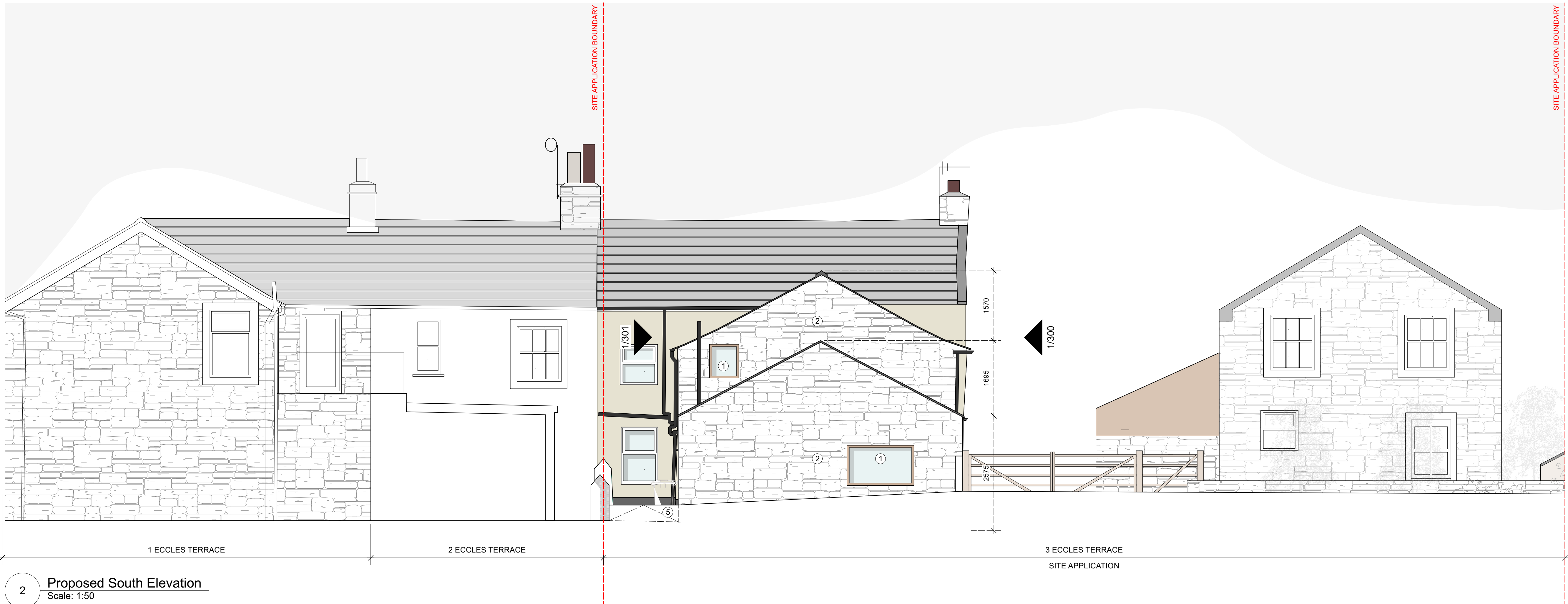
2 Proposed South Elevation Scale: 1:50