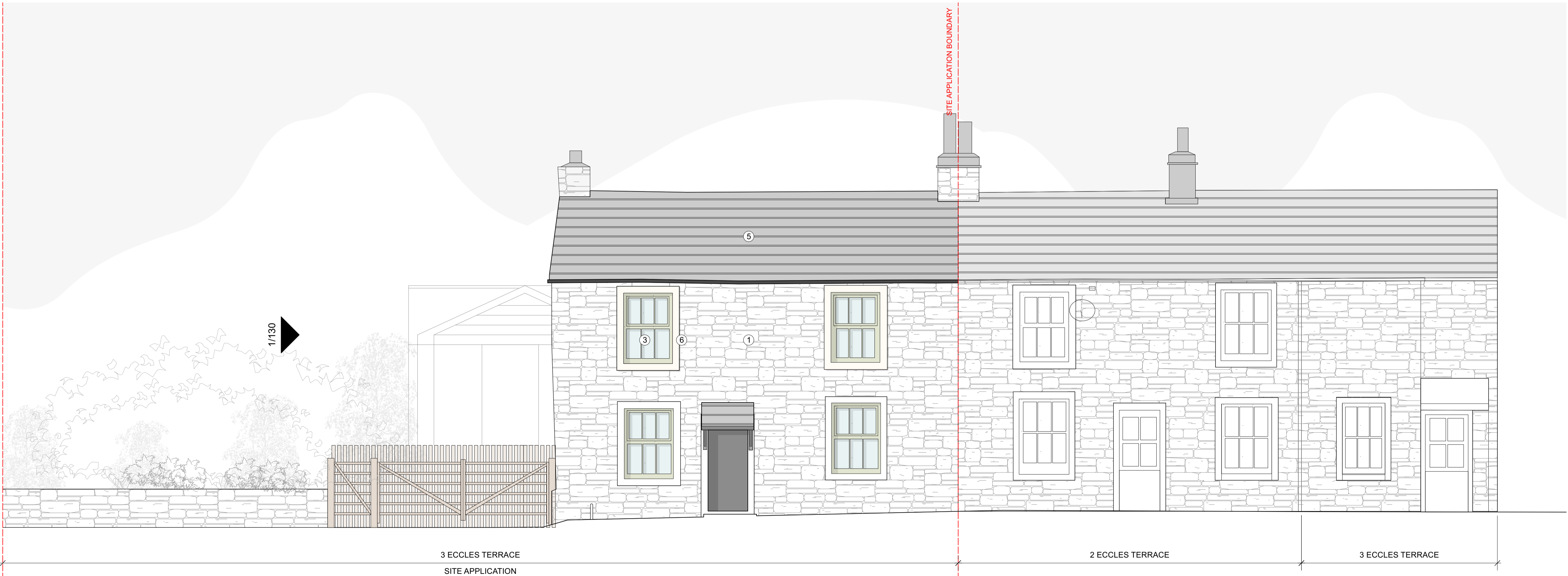
2 Existing East Elevation Scale: 1:50