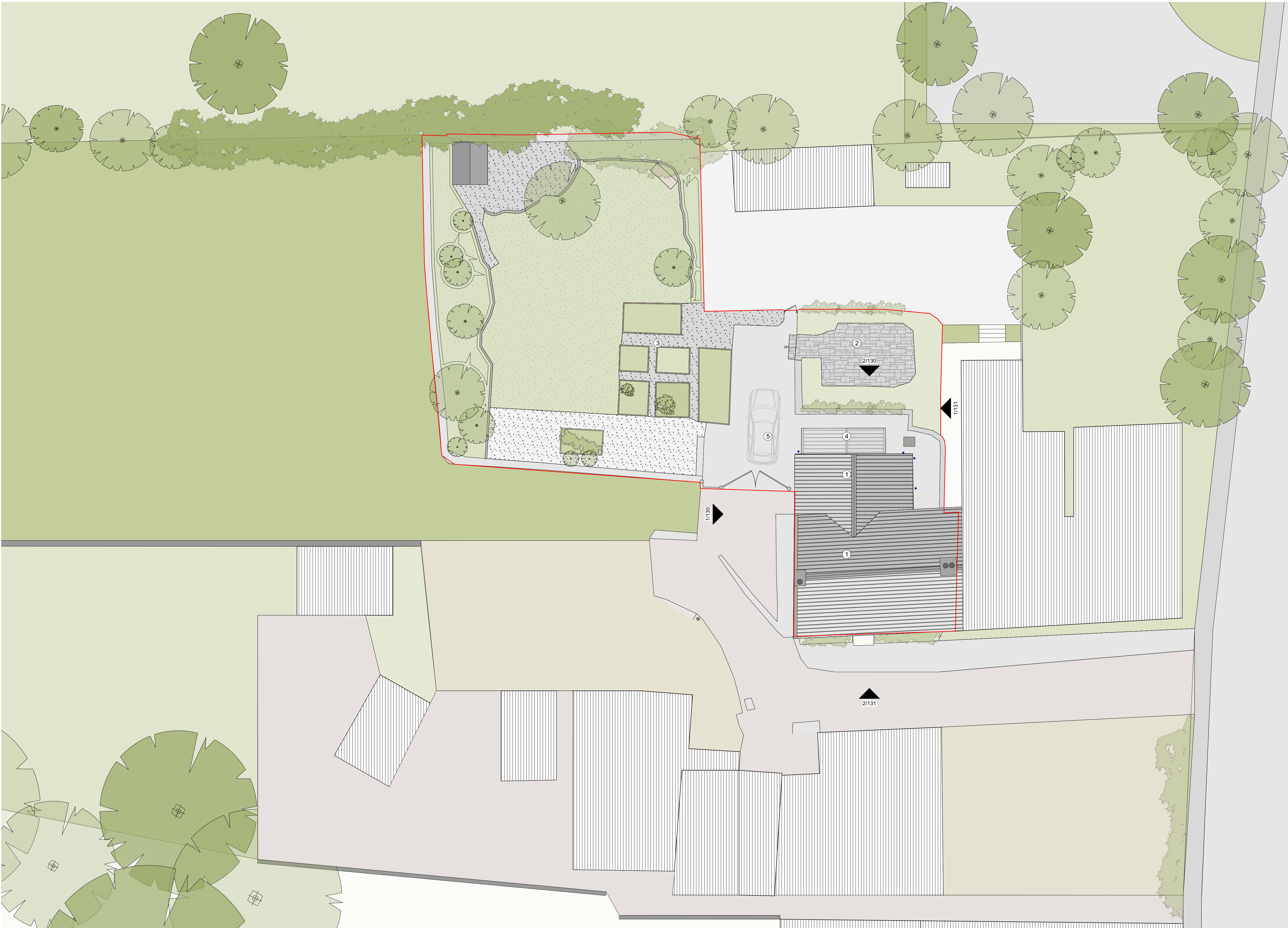
1 Existing Site Plan Scale: 1:100