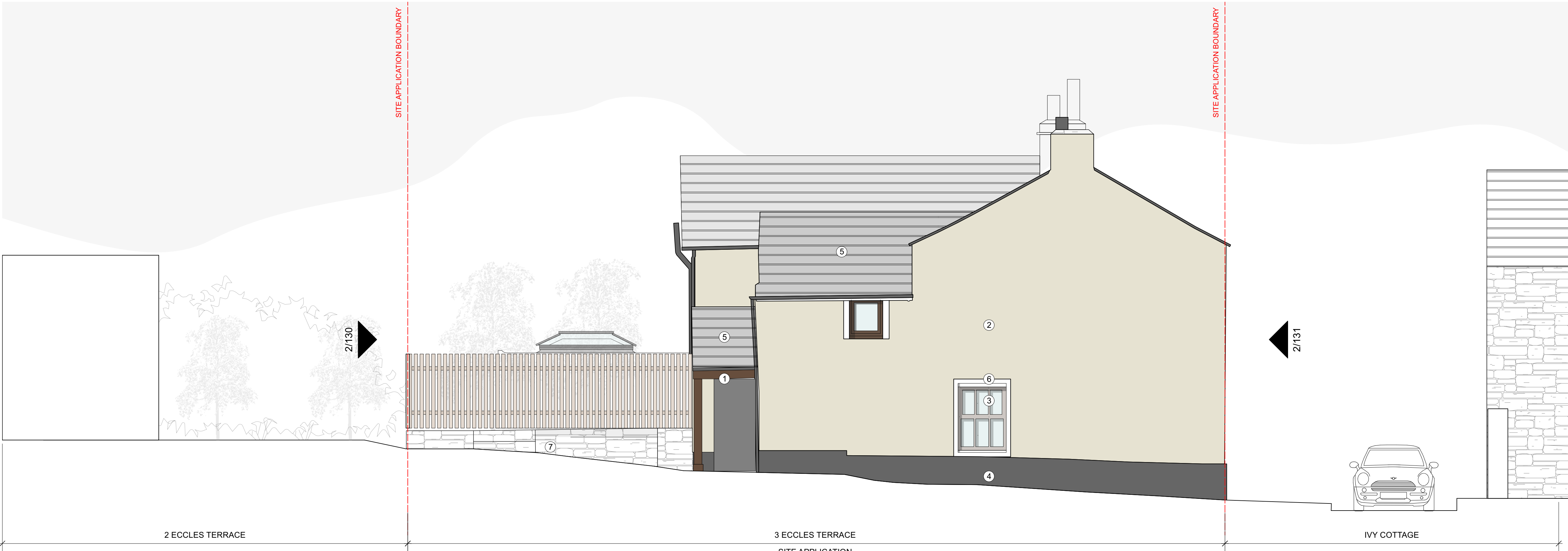
1 Existing South Elevation Scale: 1:50