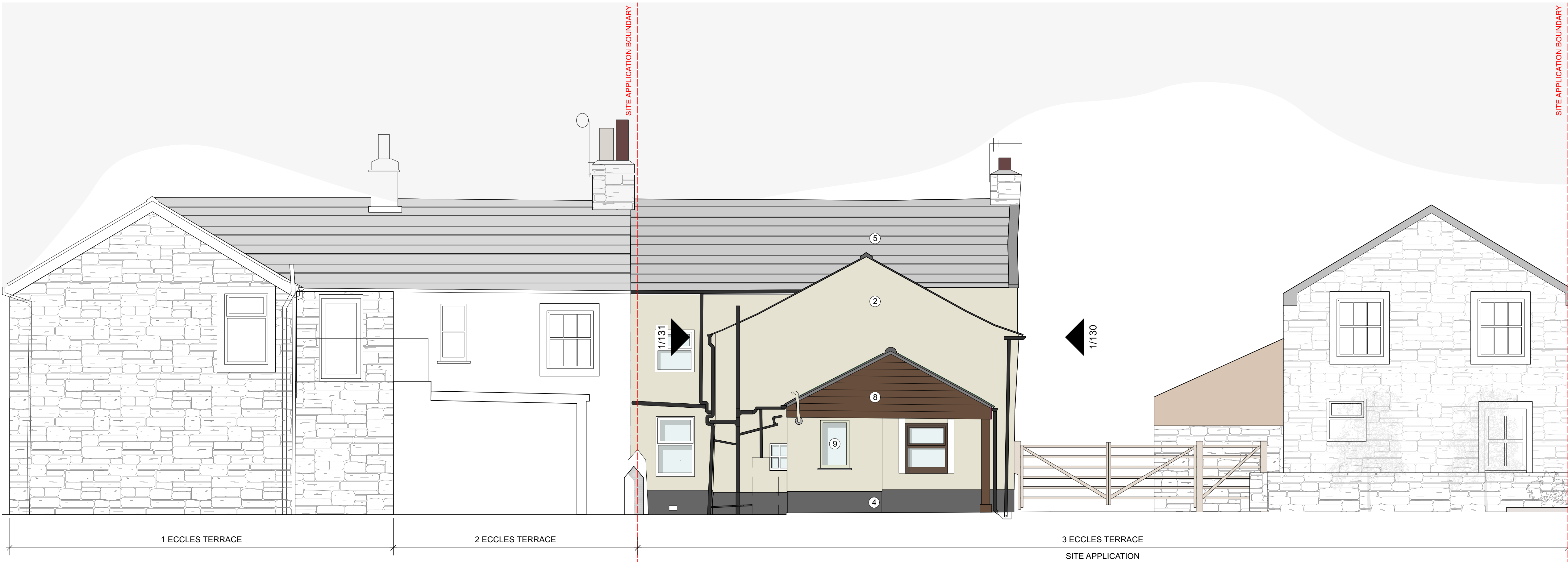
2 Existing West Elevation Scale: 1:50