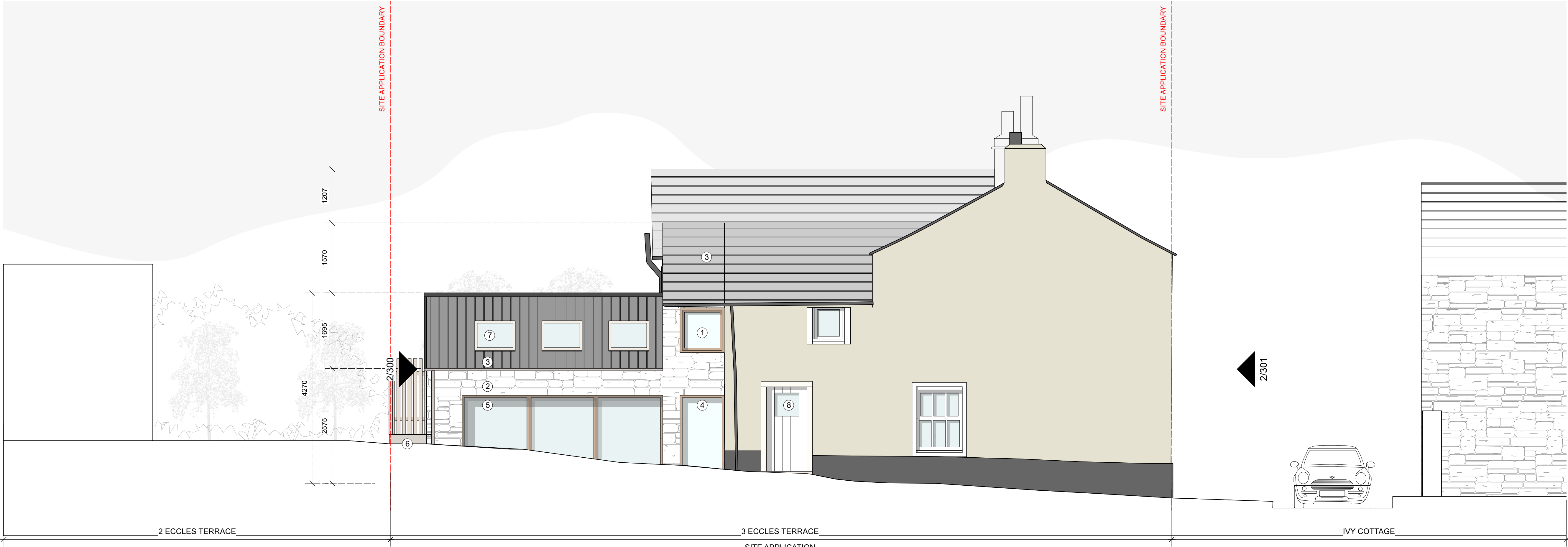
1 Proposed South Elevation Scale: 1:50