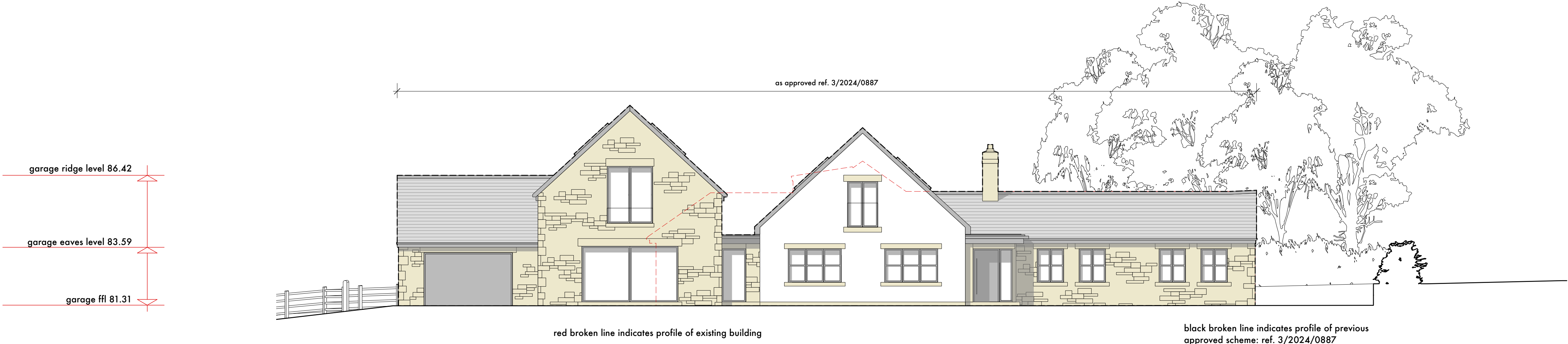
north west elevation