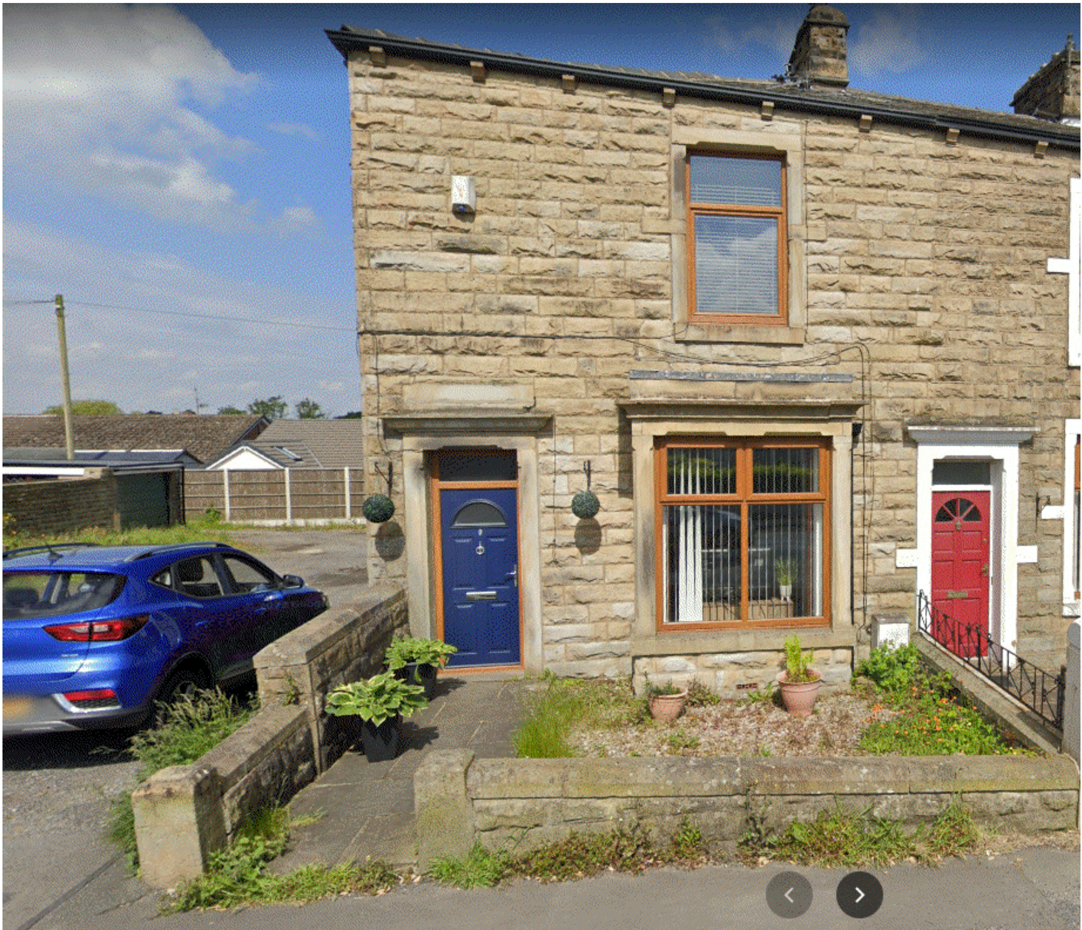
Existing Picture of Front Elevation