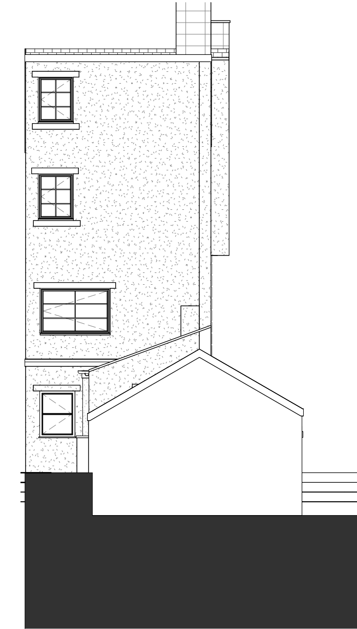
3 North Elevation 1:100