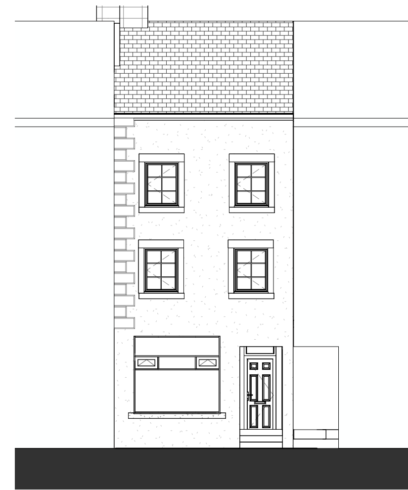
4 South Elevation 1:100