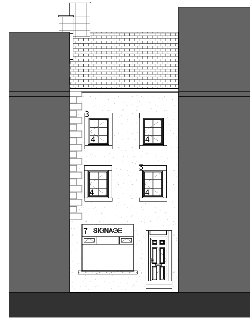
4 South Elevation as Proposed 1:100