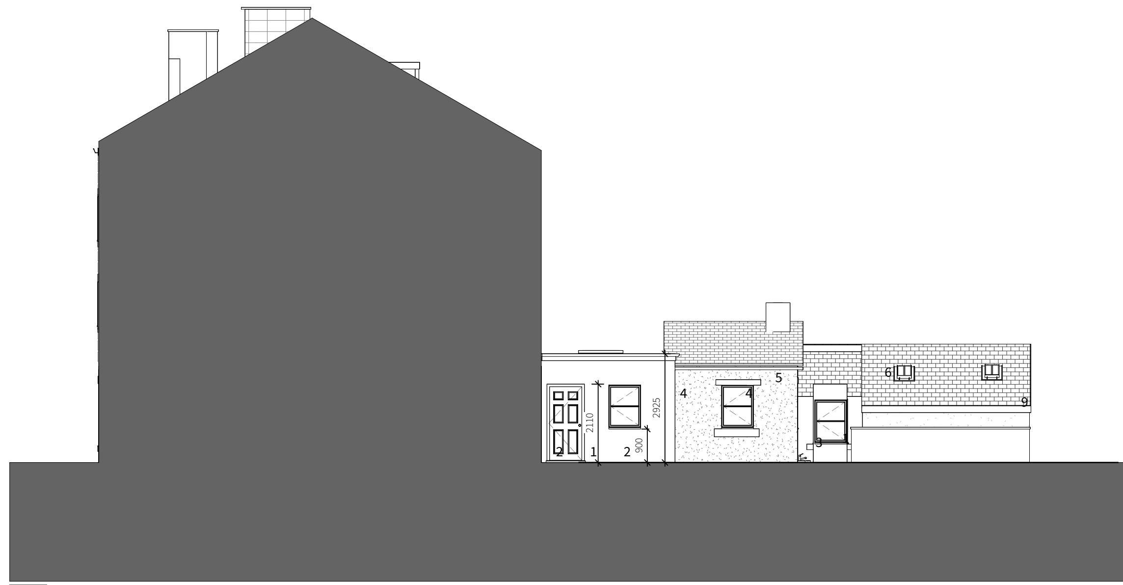
2 East Elevation as Proposed 1:100