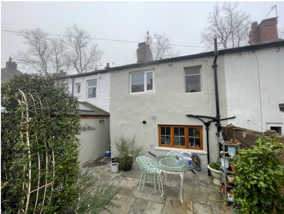
View from the rear