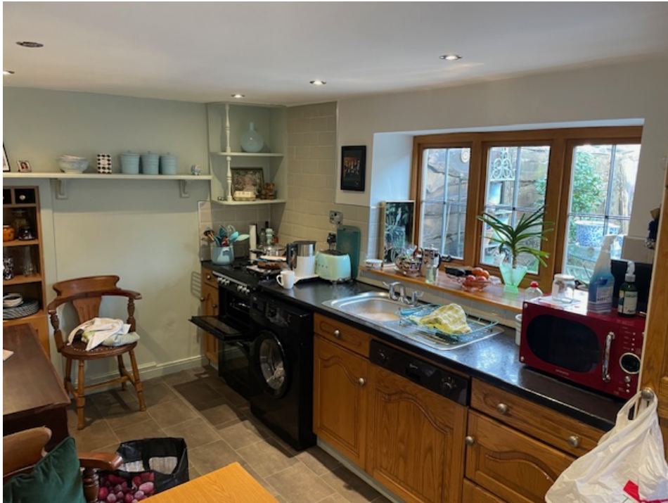
Views inside the kitchen