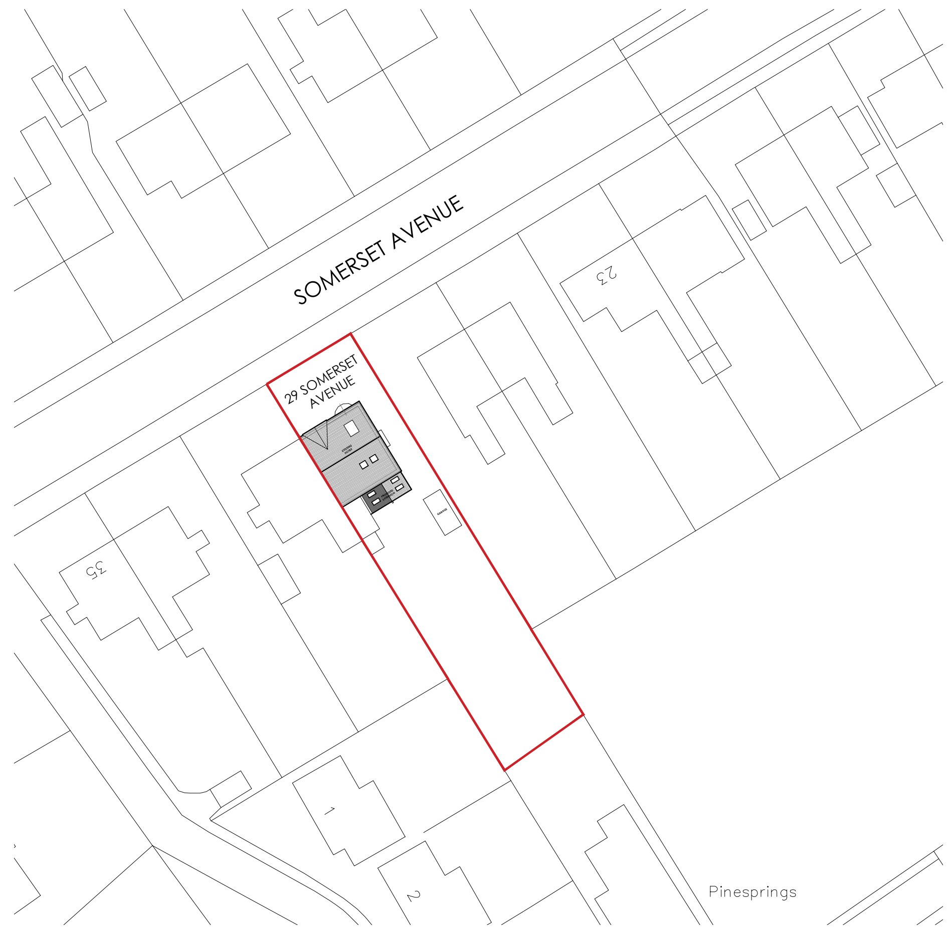
PROPOSED SITE PLAN - 1:500 Scale 0 10 20 30m