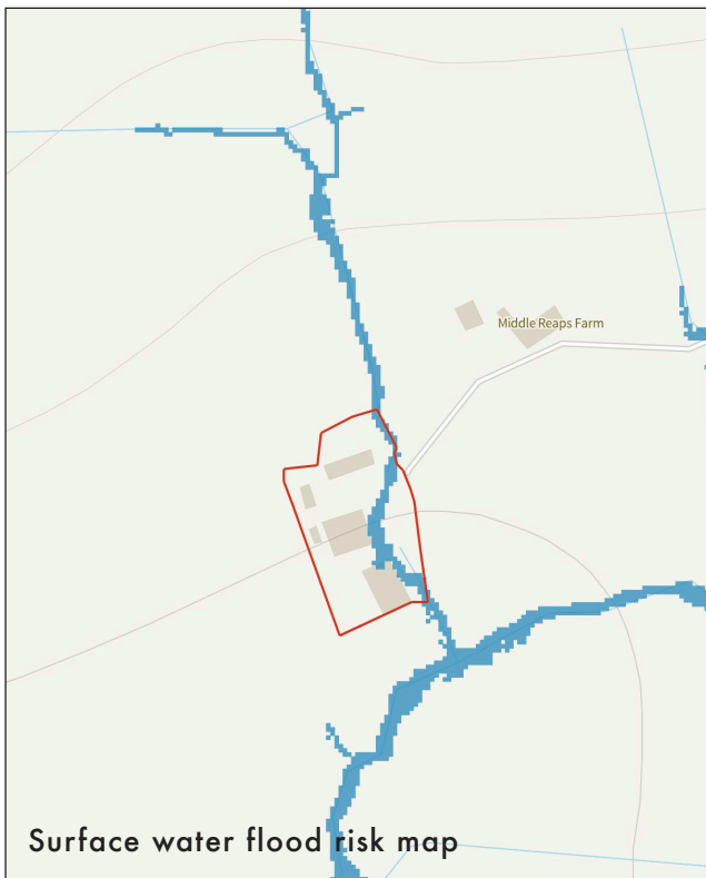
Surface water flood risk map