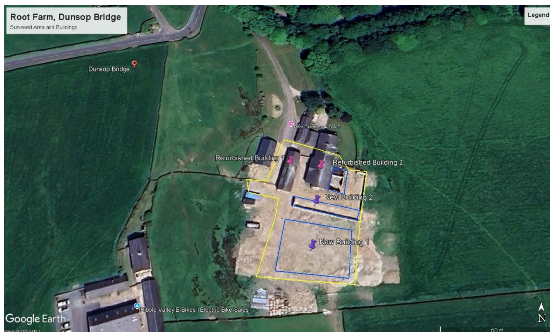
Figure 2 Buildings on site