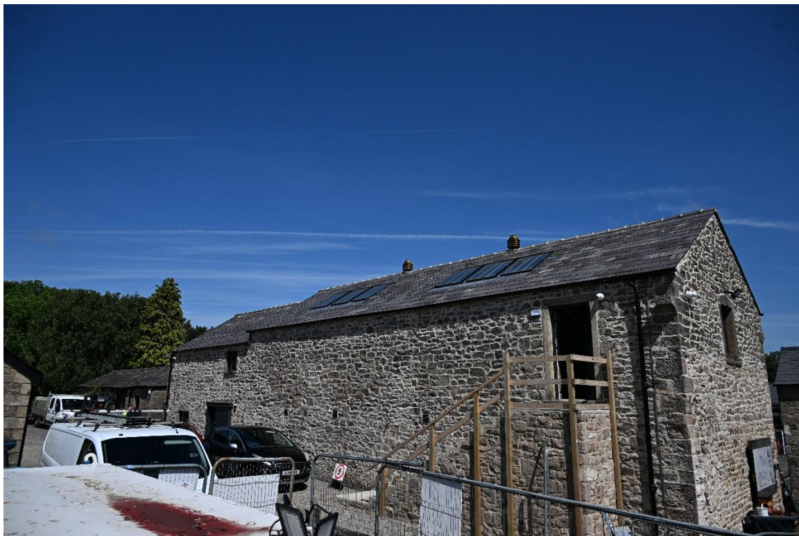
Image 1 Refurbished Building 1