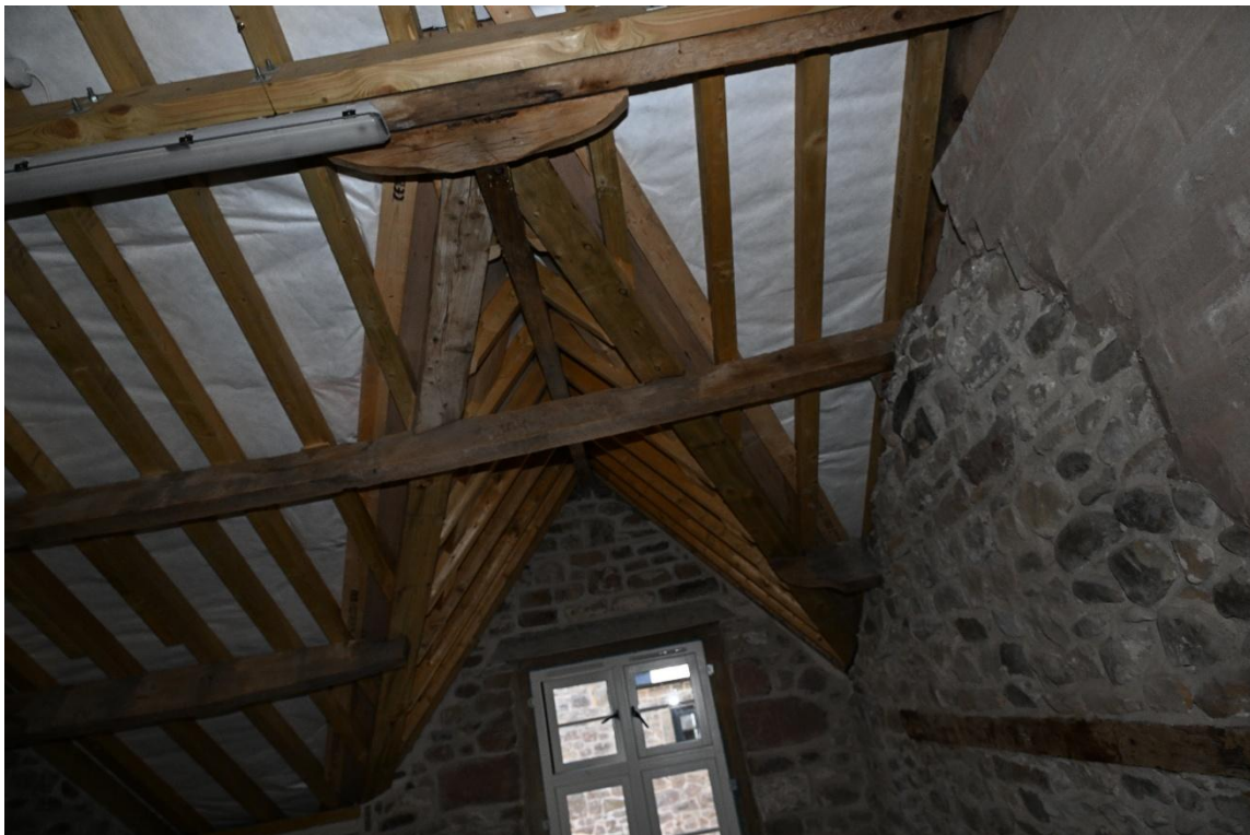
Image 4 roof structure Image 3