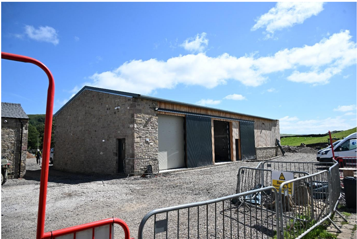
Image 6 New Barn