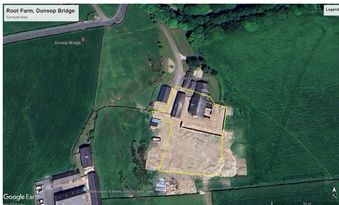
FIGURE 1. Surveyed Area indicated by the yellow line above.