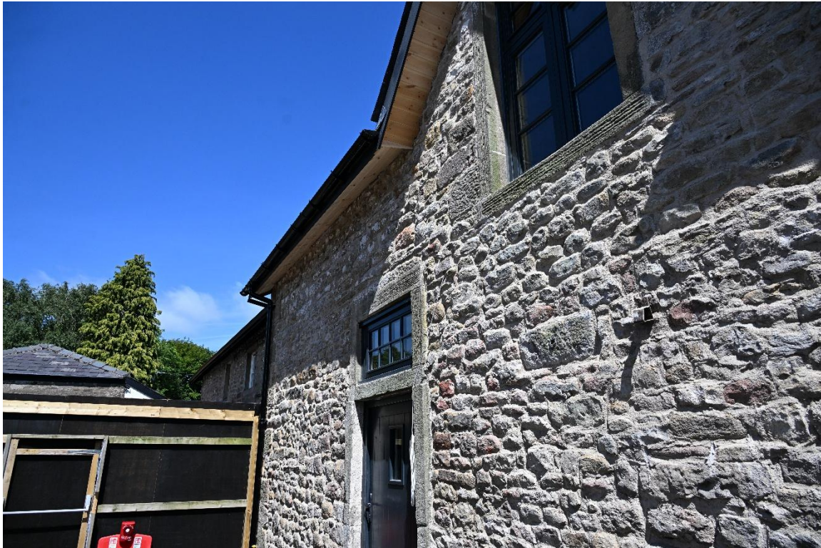
Image 3 Refurbished Building 2