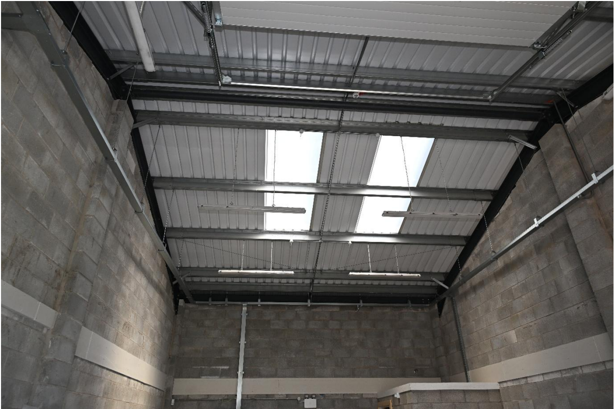
Image 7 Internal structure Image 6