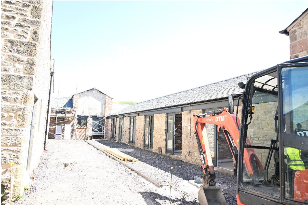
Image 5 New Office block