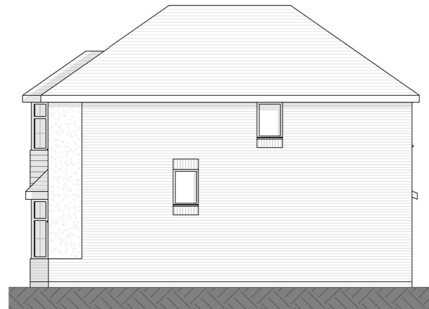
Side Elevation (facing Aspen Crescent)