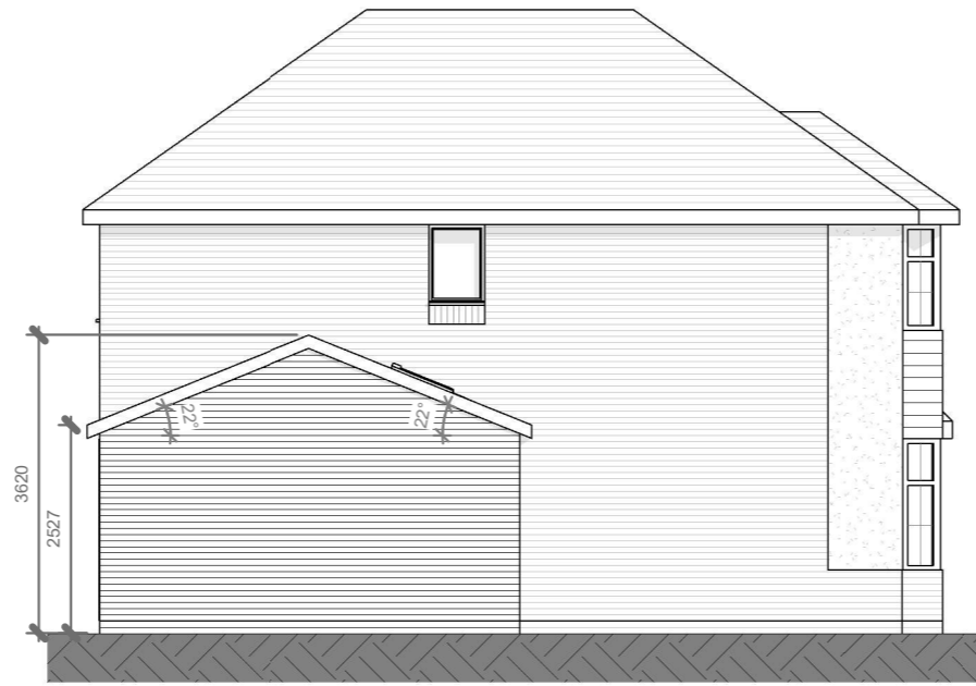
Side Elevation (Party Wall)