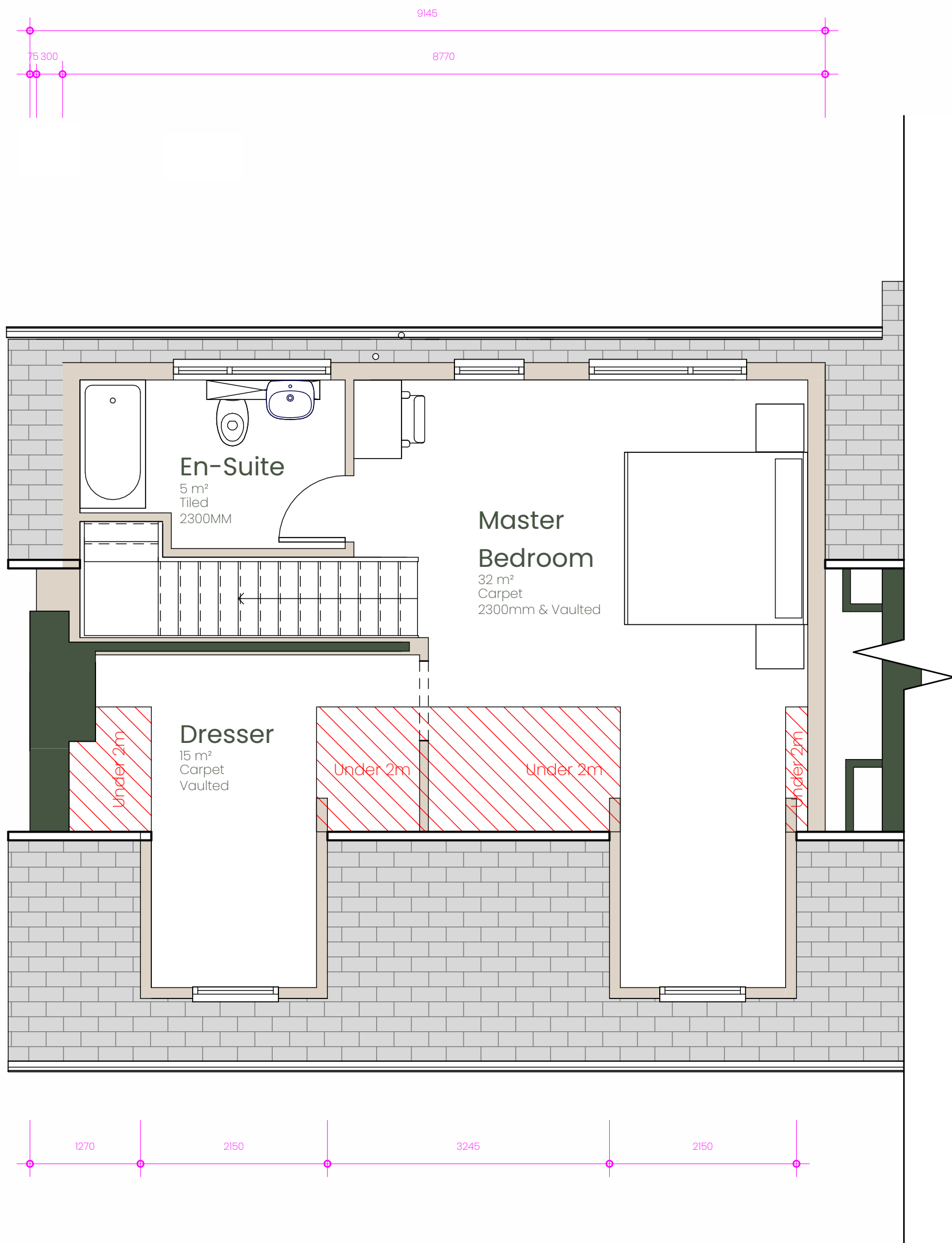
1 Planning - Proposed Eaves 1: 50

sheet name: Proposed Second Floor and Roof Plan