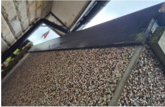
Side elevation Garage 1