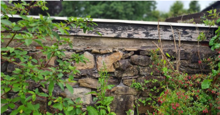
The rear wall of garage 2 is random stone.