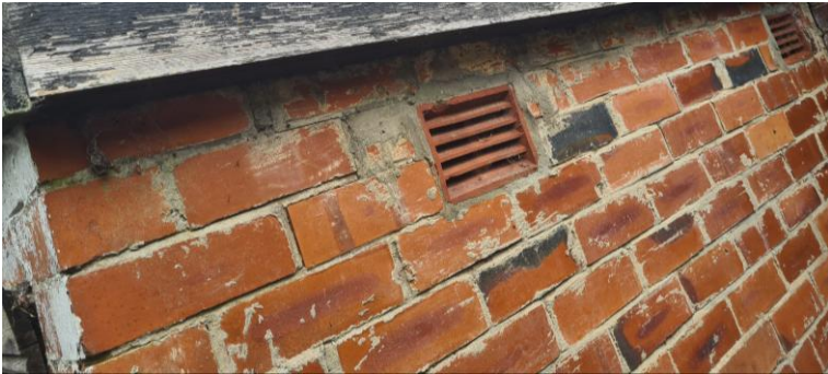
Garage 2 has single skin brick walls to the front and side elevations