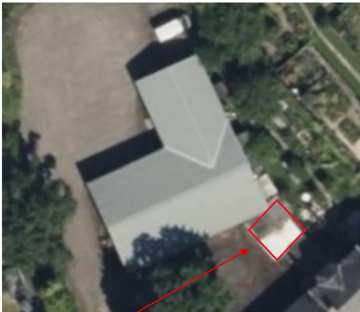
Location of garages