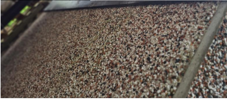
Garage 1 has prefabricated concrete walls with pebble dash finish.