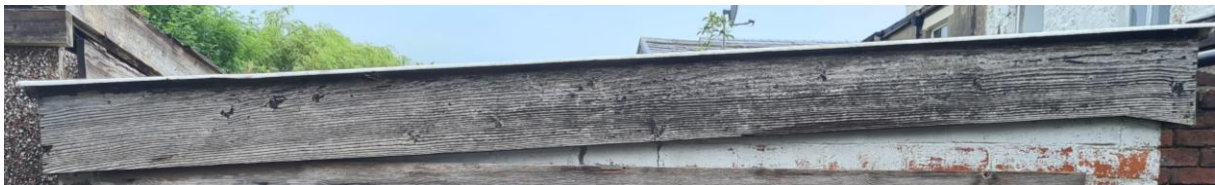
Flush fascia to the front.