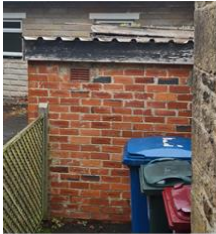
Side elevation Garage 2