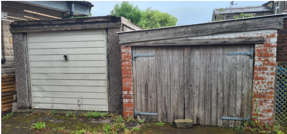
Front elevation of Garage 1 and Garage 2