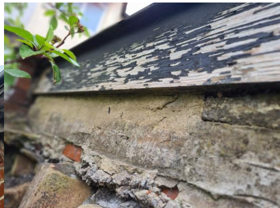
Flush fascia to the rear