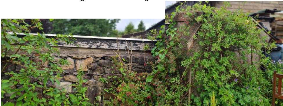
Rear Elevation Garage 2