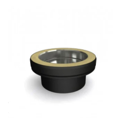
wall-adaptor-in-black.html Dura Flue Single to Twin Wall Adaptor in...