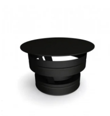
in-black-125mm.html Dura Flue Weathering Cap in Matt Black -...