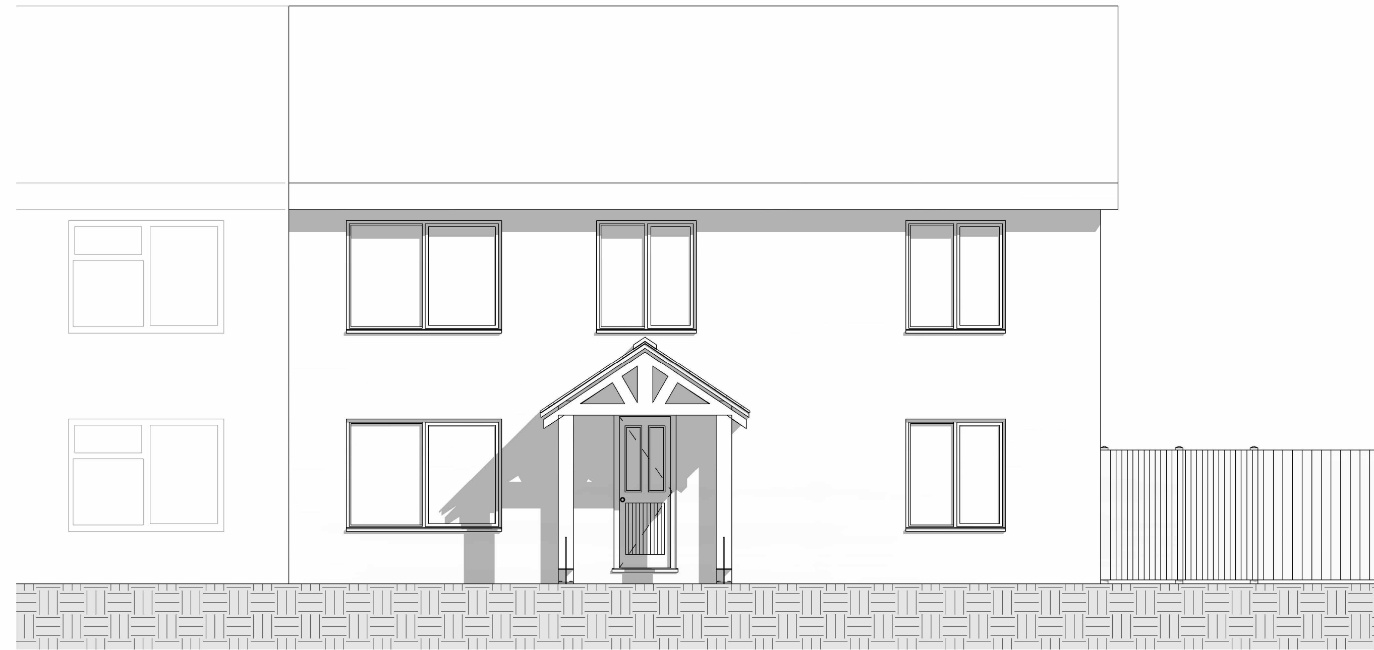
1 PROPOSED NORTH EAST 1 : 50