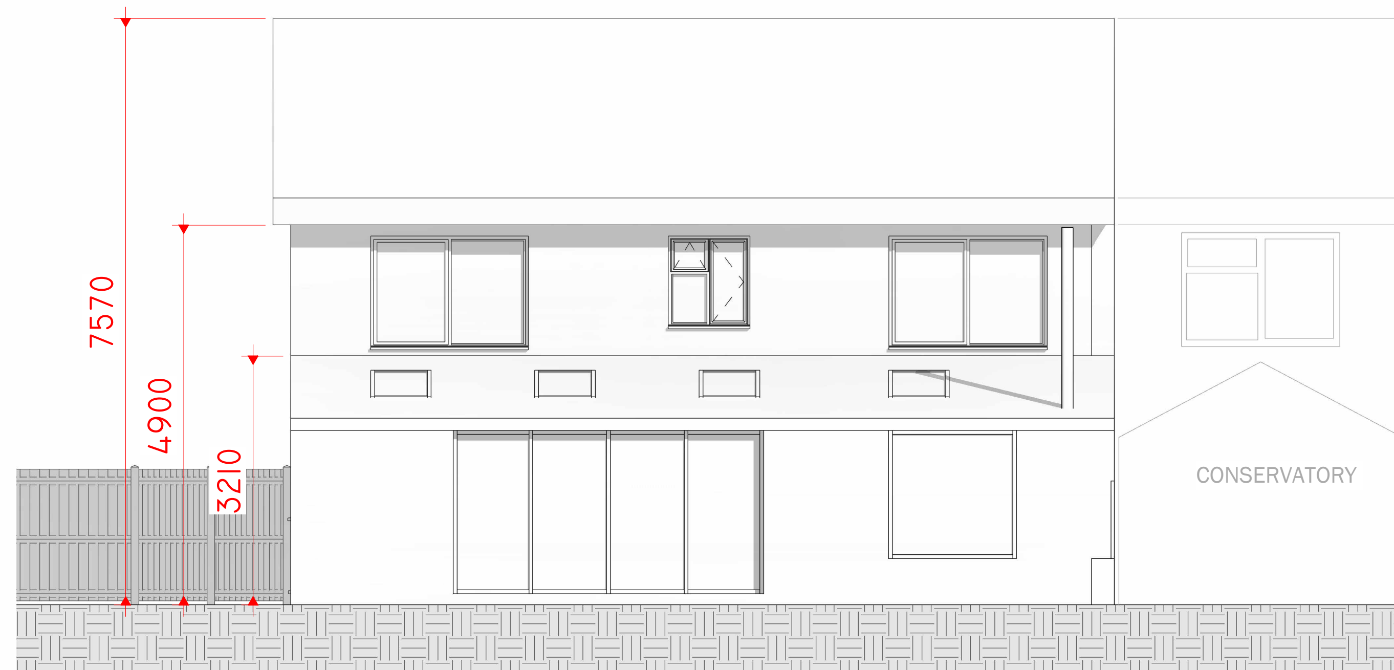
4 PROPOSED SOUTH WEST 1 : 50