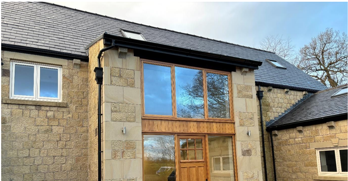
Figure 03– Depicts the eaves detail to Alston House main roof.