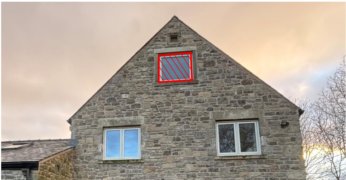
Figure 05– Shows the mortar bedded eave to North elevation of Alston House main roof (Hatched window to be removed).