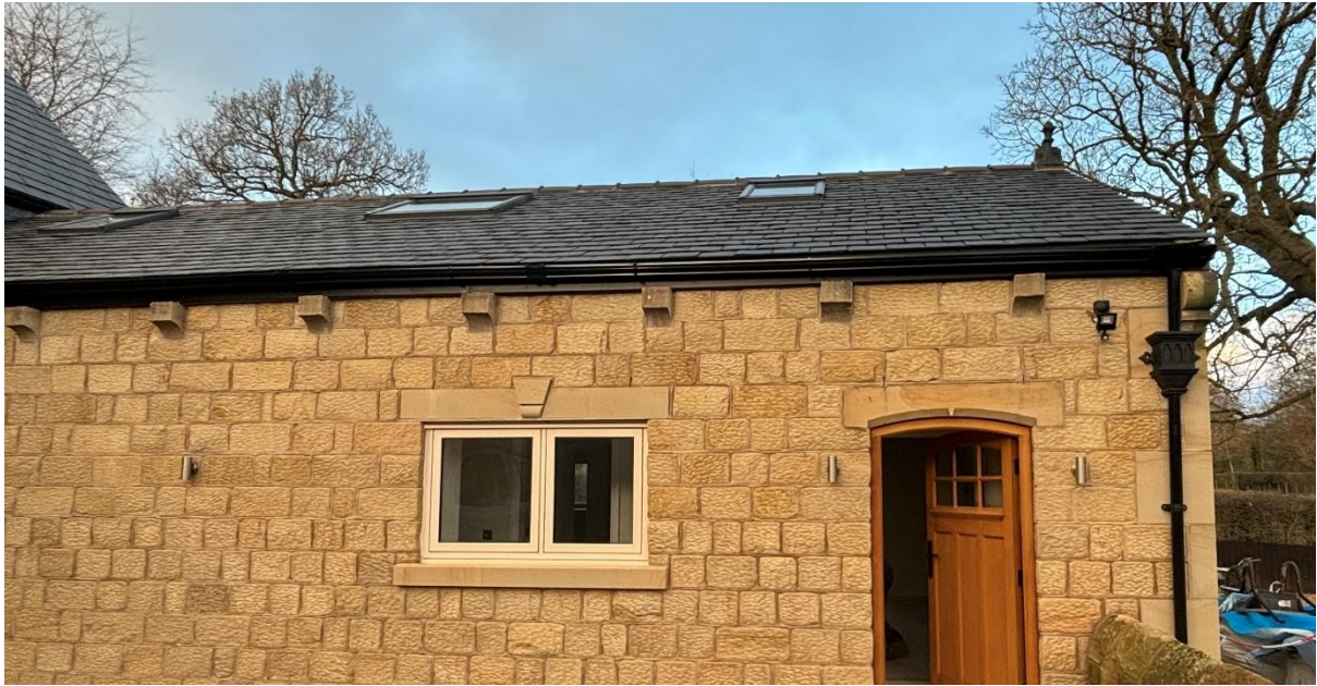
Figure 04– Depicts the eaves detail to Heron View.