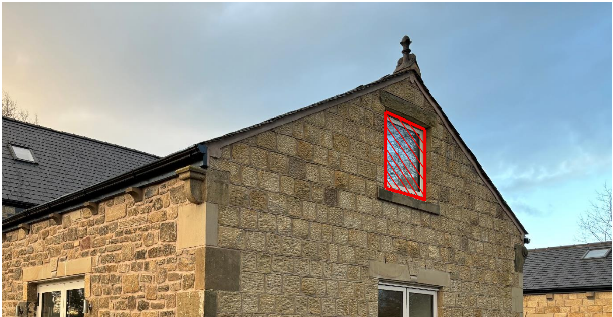
Figure 02 – Shows the mortar bedded verge and eave of the adjoining section of Alston house (Hatched window to be removed).