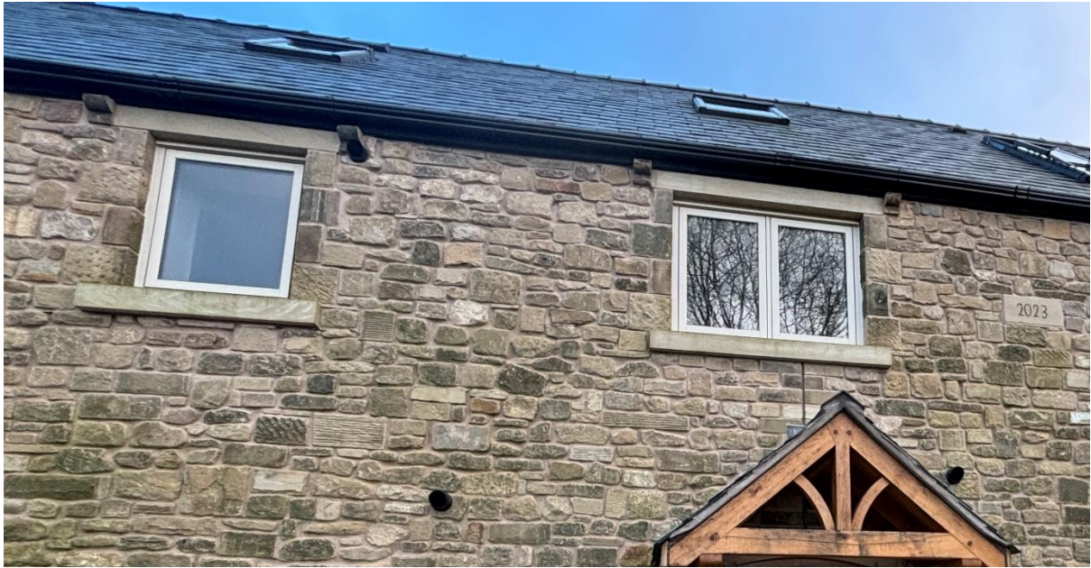
Figure 06– Depicts the eaves detail to Heron View main roof.