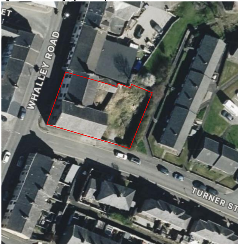
Figure 1.1: Aerial image of the surveyed area

The site is located in the centre of Clitheroe, off Turner Street. The address is 45 - 47 Whalley Road, Clitheroe, BB7 1EH. The central grid reference is SD 74251 41280. An aerial image of the site is shown below.