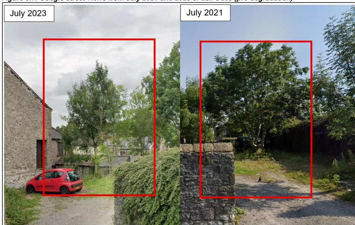
Figure 3.1: Google street views from July 2021 and 2023 of ash trees (pre-degradation)

In order to account for the degradation, the statutory biodiversity metric was carried out using the 'pre-degradation' habitat type (urban tree) with the condition assessment completed through a review of historical maps (google maps).