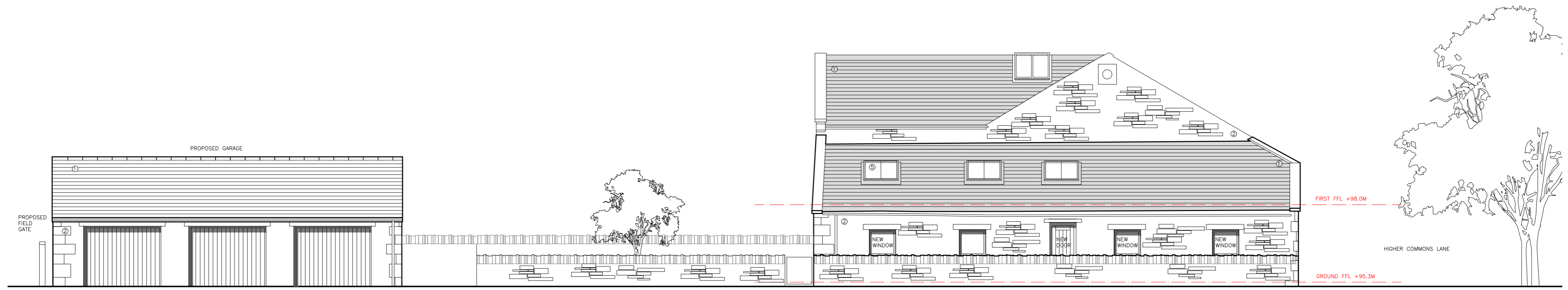
PROPOSED SOUTH WEST ELEVATION (2)