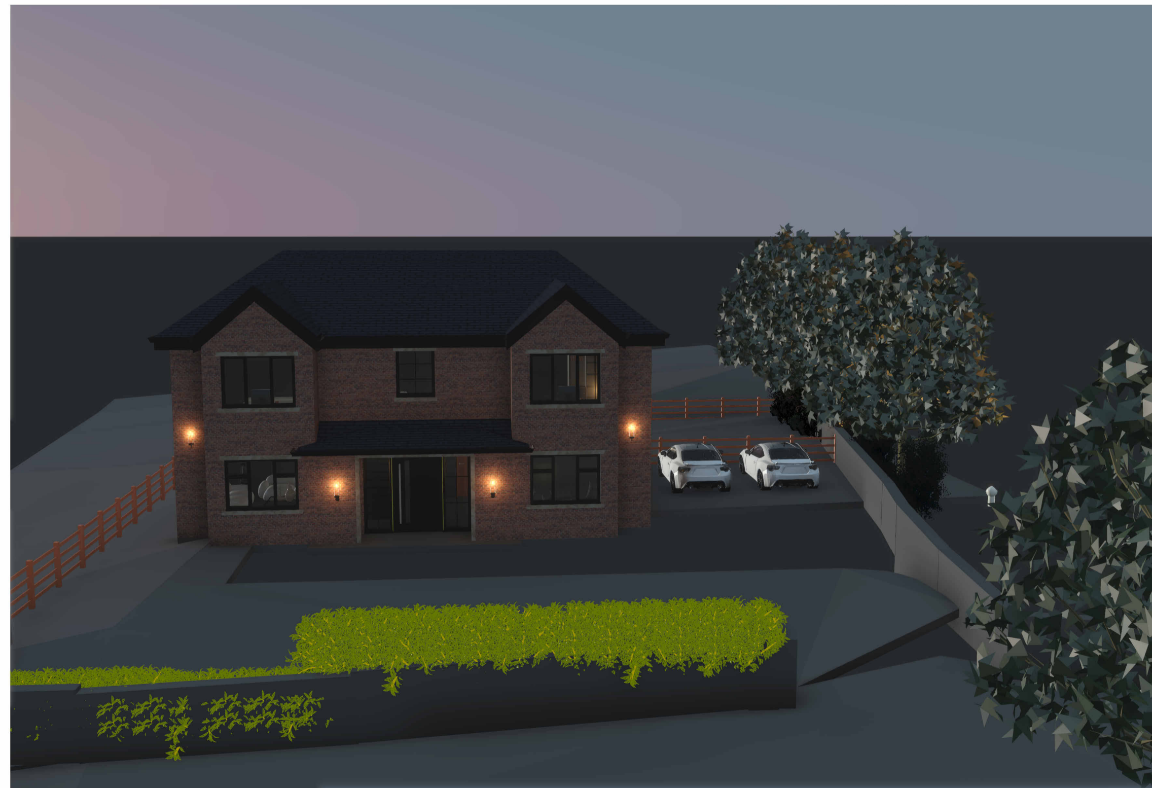
4 FRONT DARK