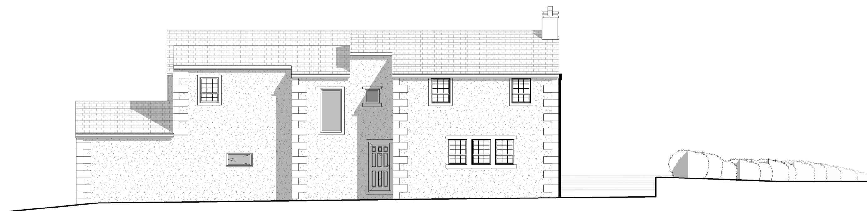
3 EXISTING NORTH WEST 1 : 100