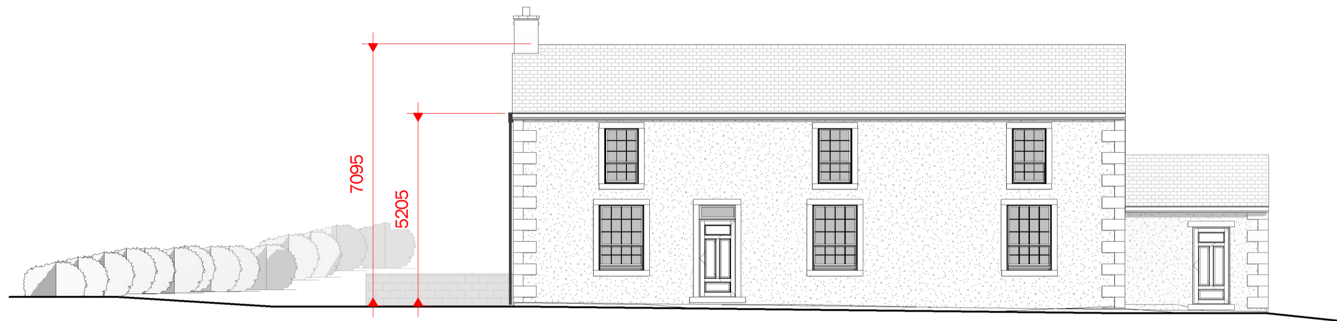
2 EXISTING SOUTH EAST 1 : 100