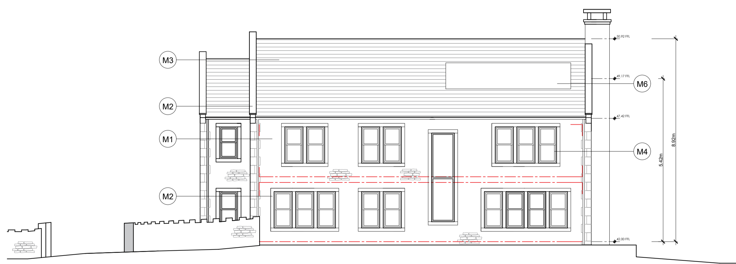
Proposed West (Front) Elevation Scale 1:100