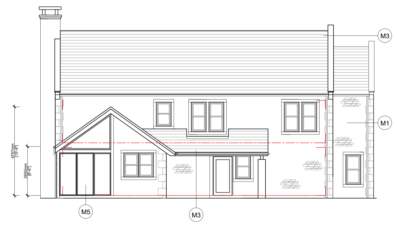
Proposed East Elevation Scale 1:100