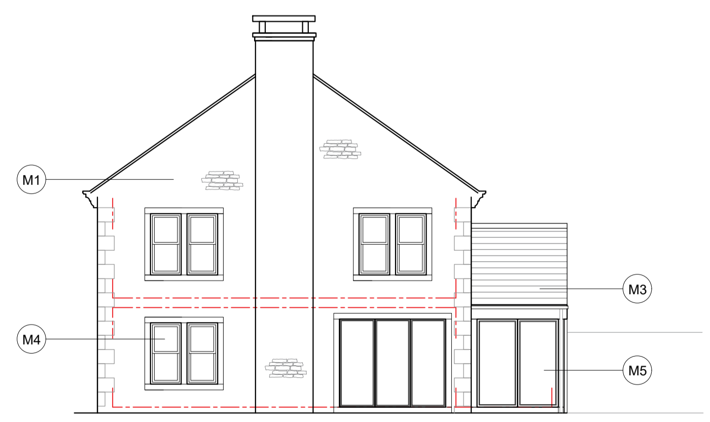
Proposed South Elevation Scale 1:100