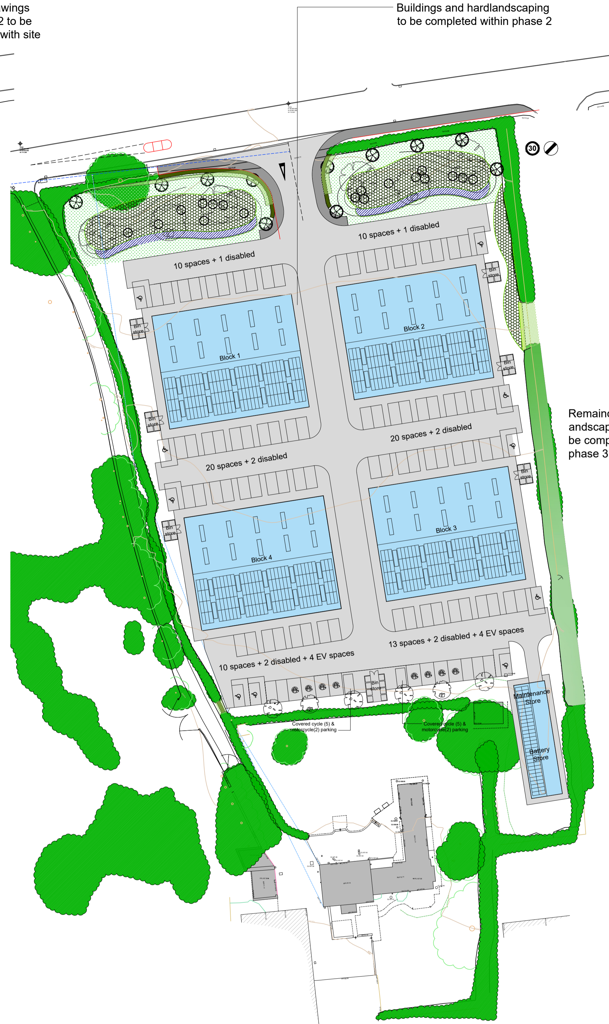
Phase 2 - Construction of Buildings and Hardlandscaping