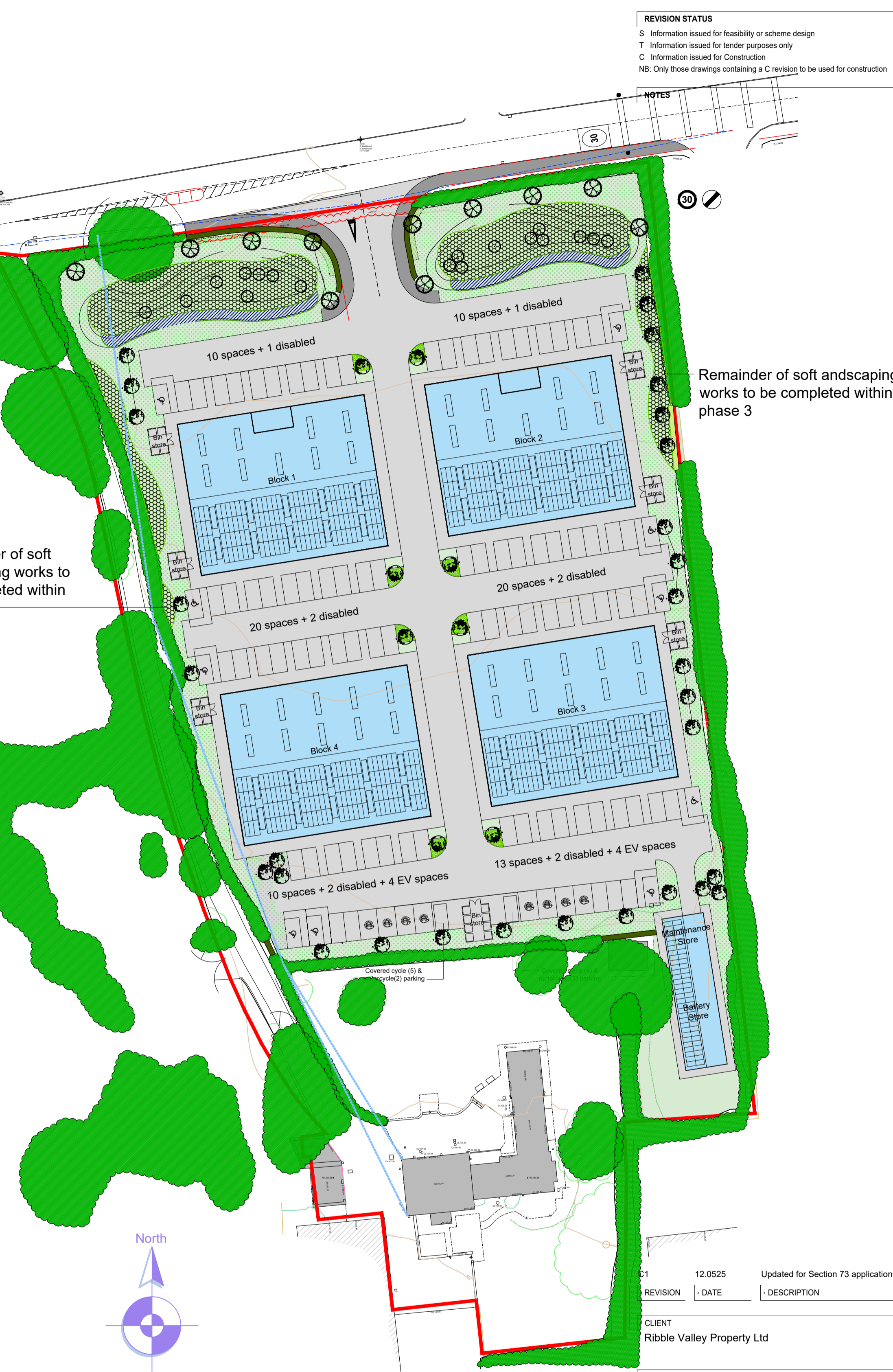
Phase 3 - Remainder of Soft Landscape Works