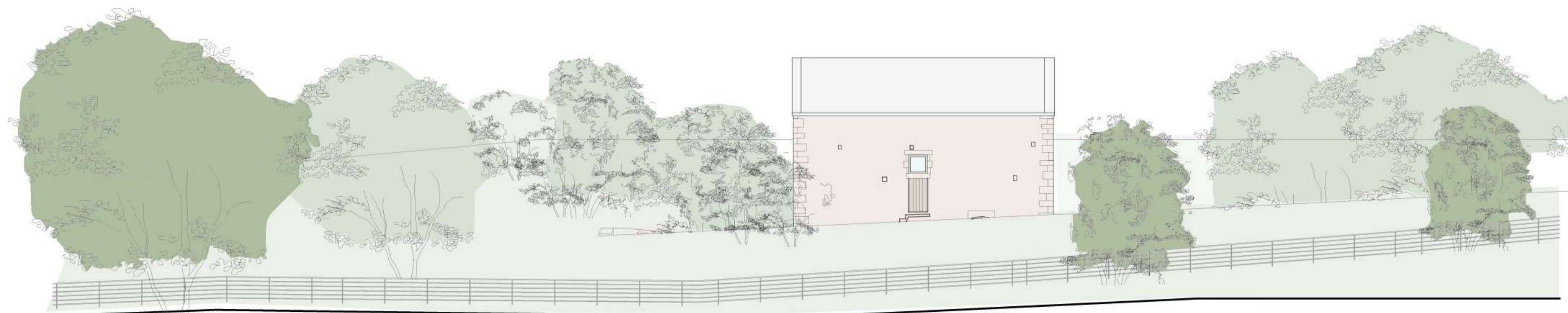
Field Barn Proposed North-East Elevation