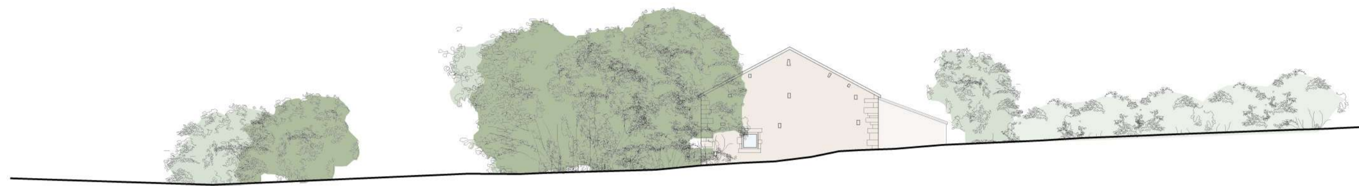
Field Barn Proposed North-West Elevation