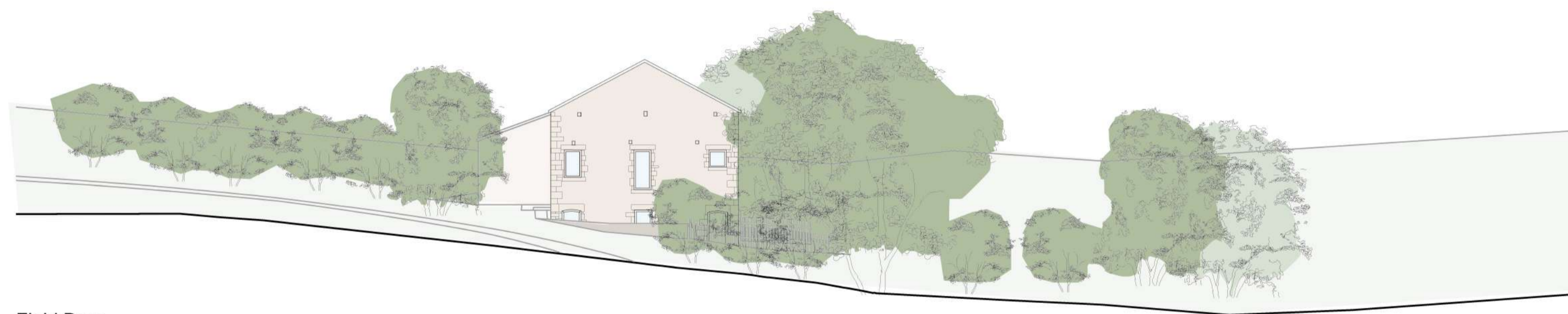
Field Barn Proposed South-East Elevation