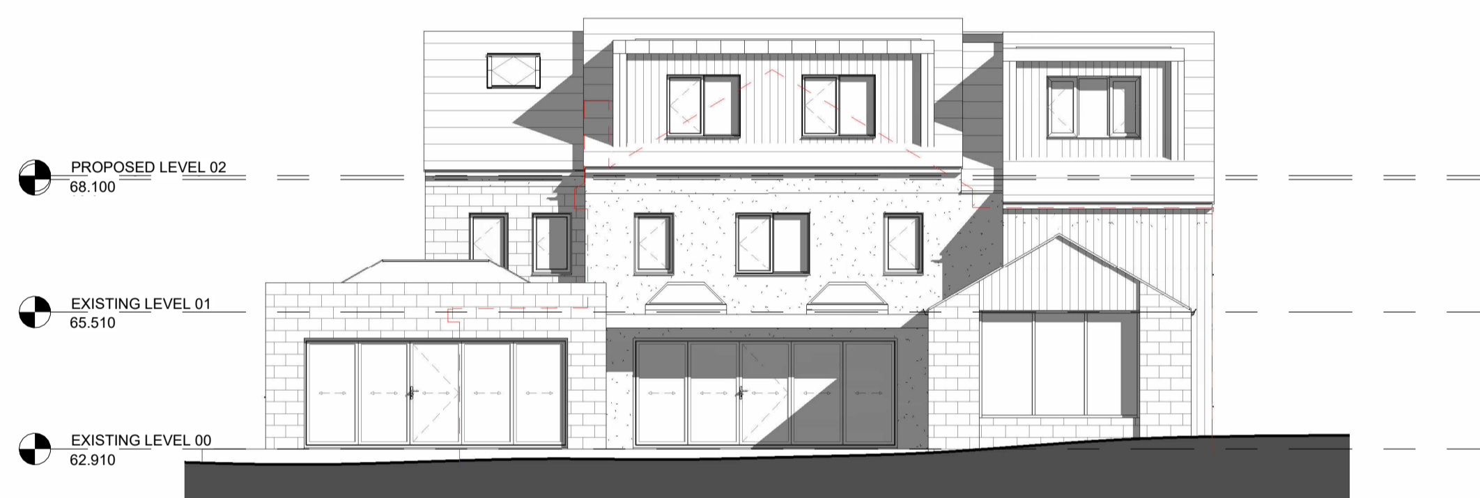
Proposed North East Elevation 1 : 100