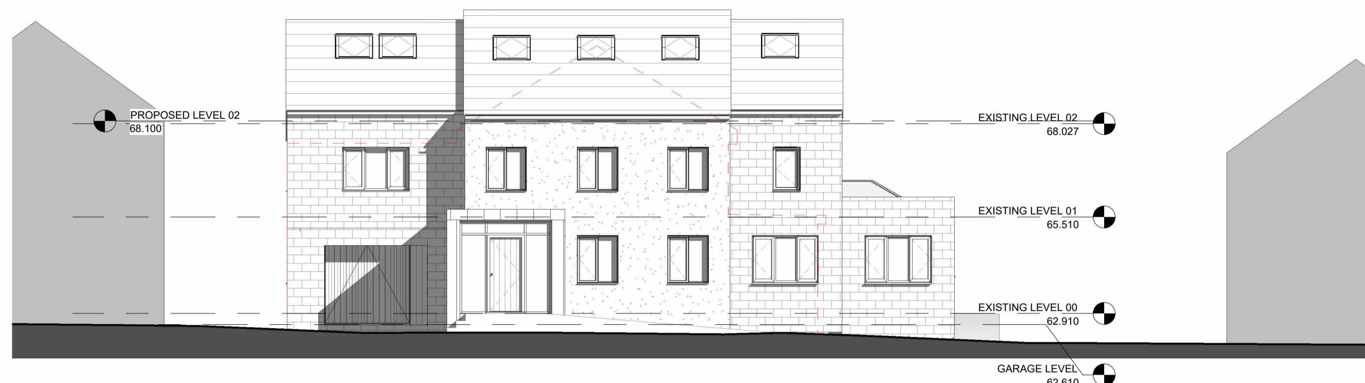
Proposed South West Elevation 1 : 100

Copyright: This drawing is the sole copyright of Daniel Wood Architect's any reproduction in any form is forbidden unless permission is granted in writing. Do not scale from this drawing, any discrepancies on site should be brought to the attention of Daniel Wood Architect's. Work and materials must comply with the current building regulations and any relevant codes of practice, and must be read in conjunction with the building specification and any other consultants or sub-contractor information.