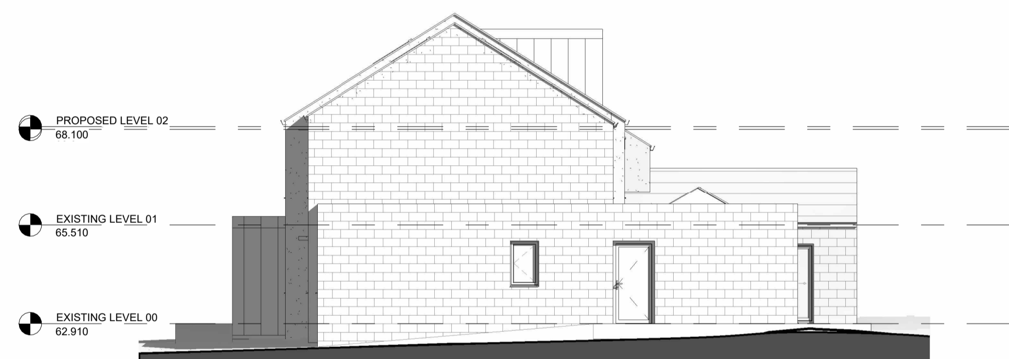
Proposed South East Elevation 1 : 100