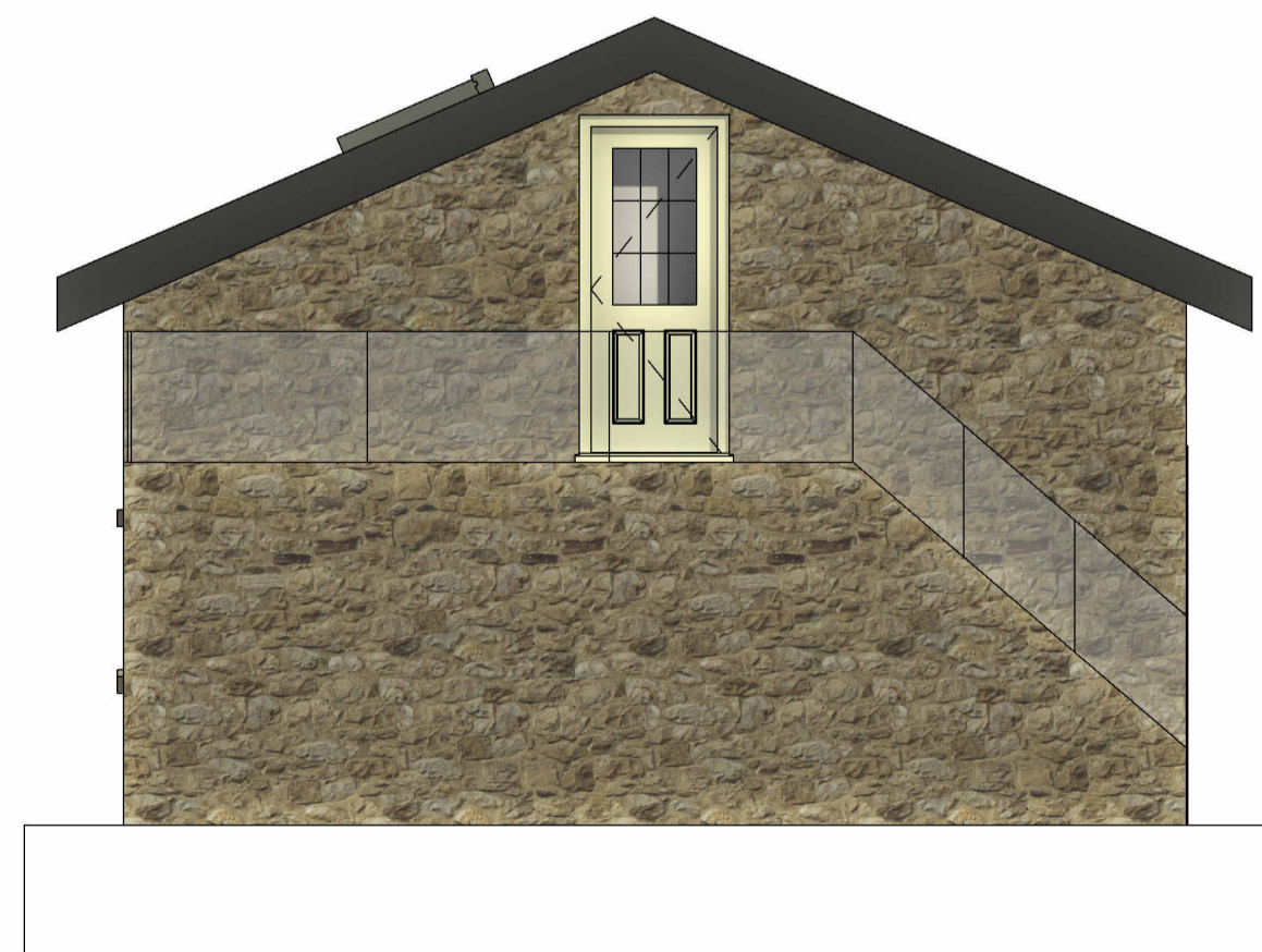
6 WEST 1 : 50