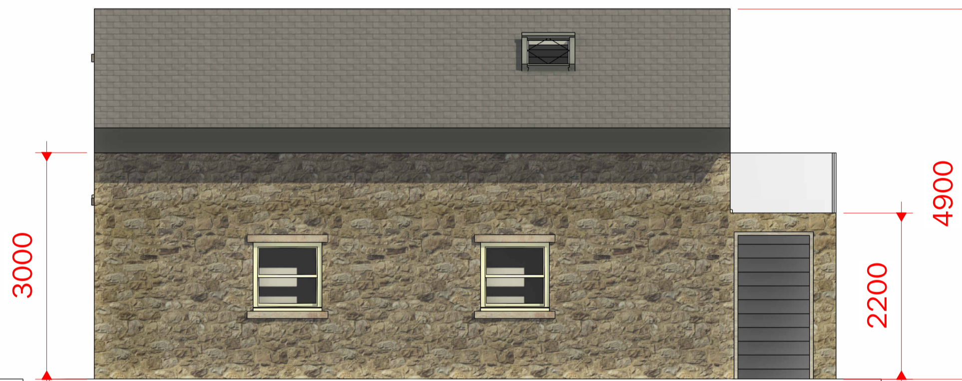
4 NORTH 1 : 50