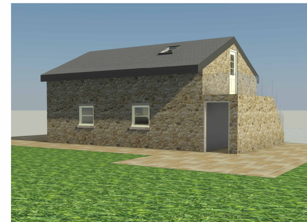
9 3D View 3