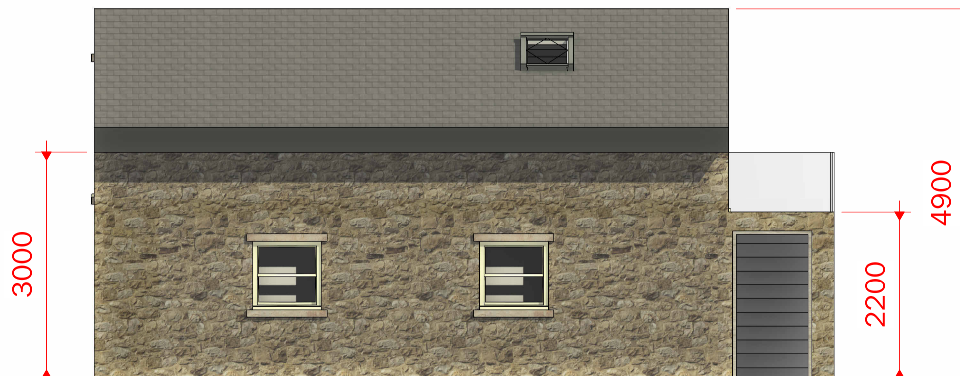
4 PROPOSED NORTH 1 : 50