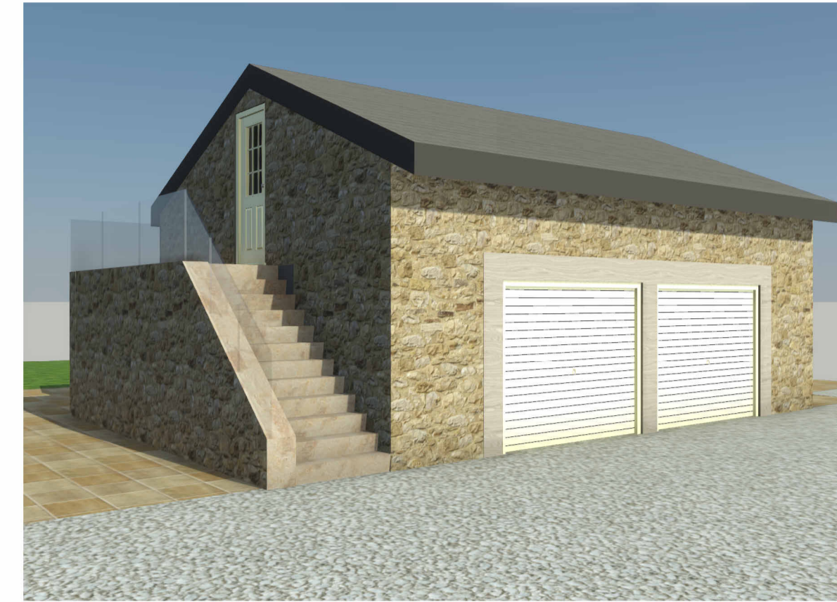
7 3D View 2