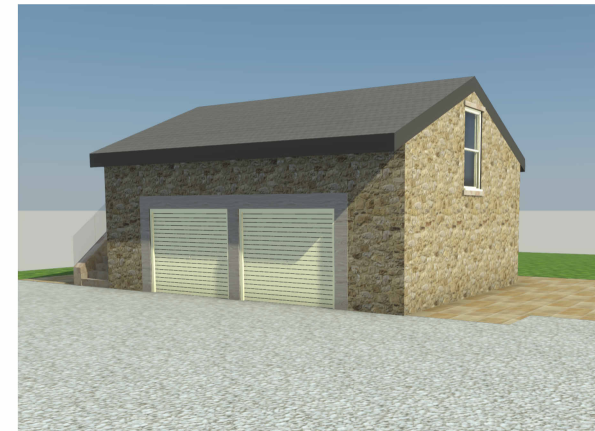
8 3D View 1