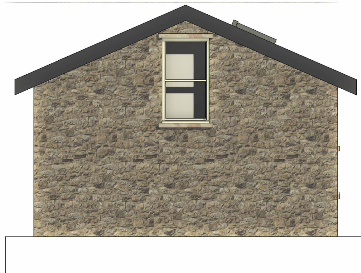
3 PROPOSED EAST 1 : 50