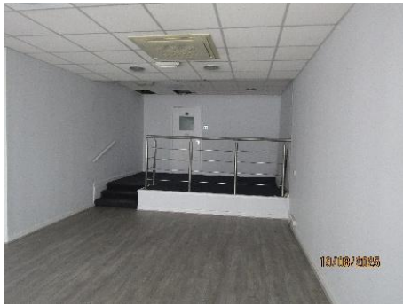
Above : Rear of shop image