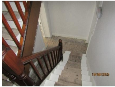
Staircase to second floor