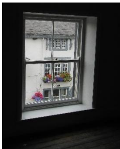
Above: Original window facing Castle Street