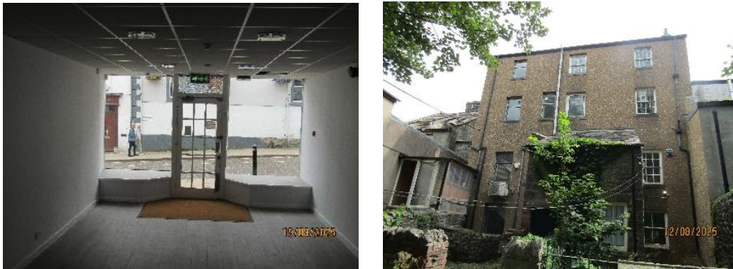
Above: Looking from shop into castle street Rear elevation image