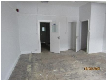
Above: first floor room