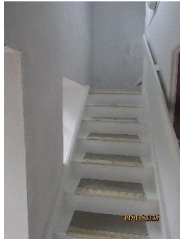
Internal steps to first floor