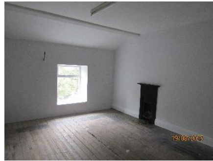
Second floor room