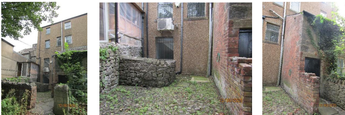
Above : Rear elevation images