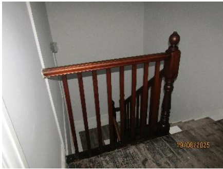
Above: second floor landing