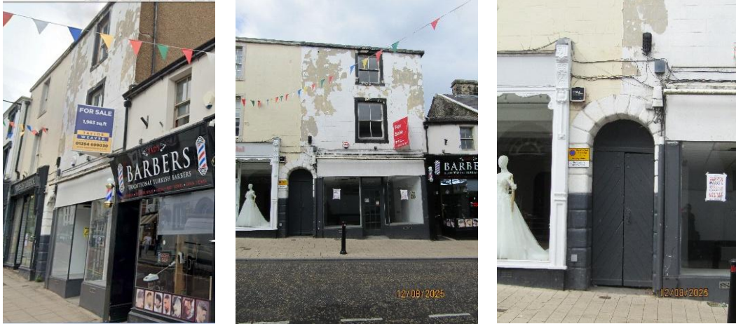
Above: Front elevation images facing Castle street