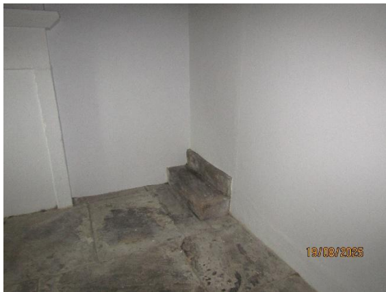
Above: image of historical steps start point in basement