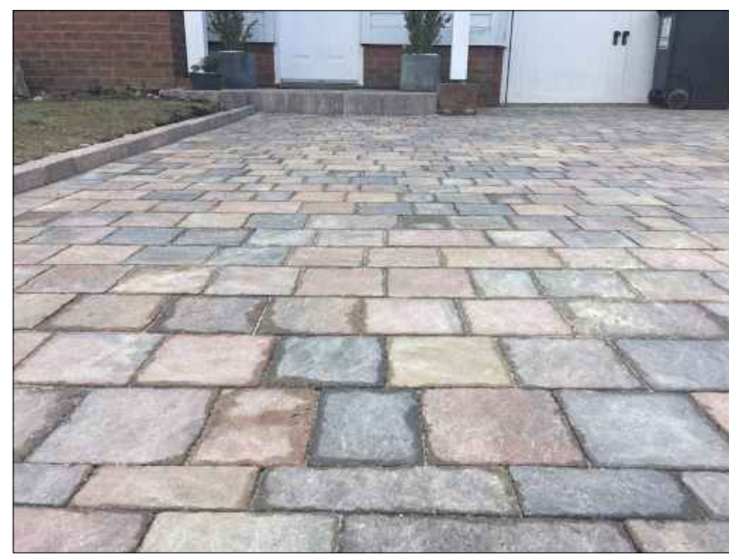
Tegula sett paving