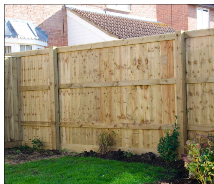
Close board timber fence to boundaries