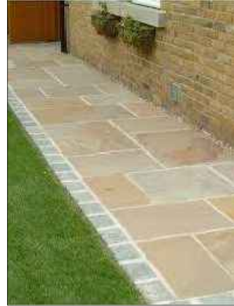
Sandstone flag paving with sett edging