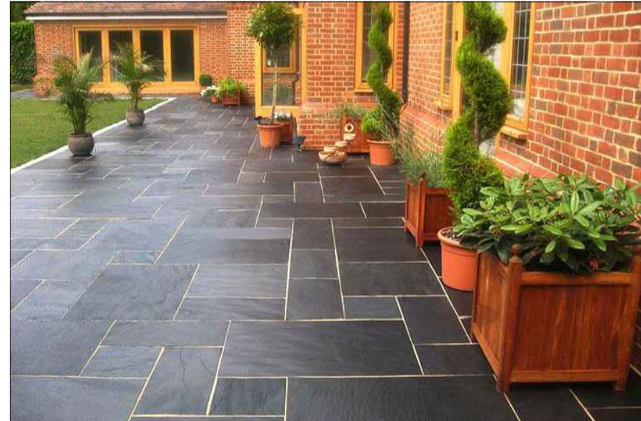
Slate flag paving