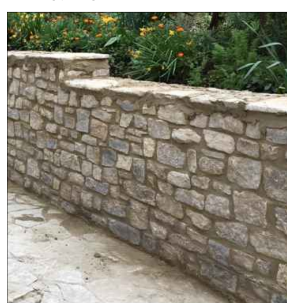
Stone retaining wall to front and rear gardens