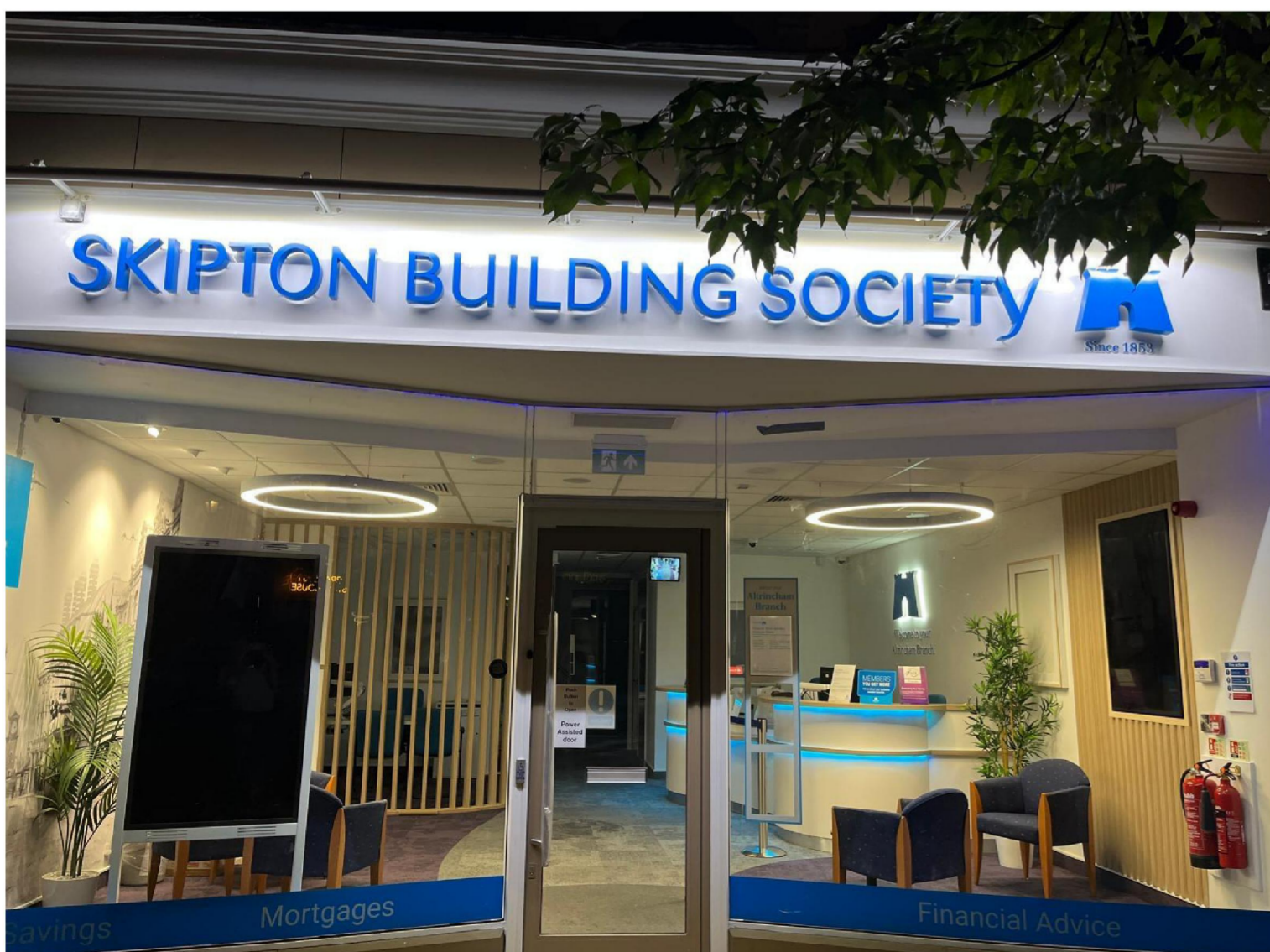
Example of proposed signage from Altrincham Branch