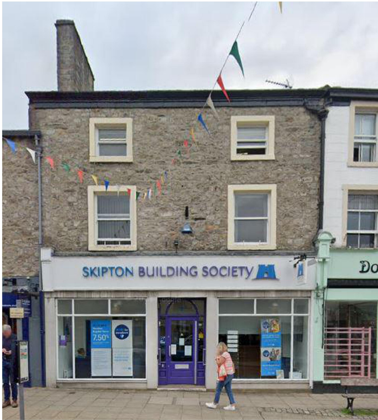
Elevation of existing shopfront