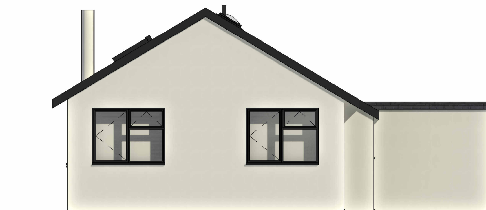
2 PROPOSED NORTH EAST 1 : 50