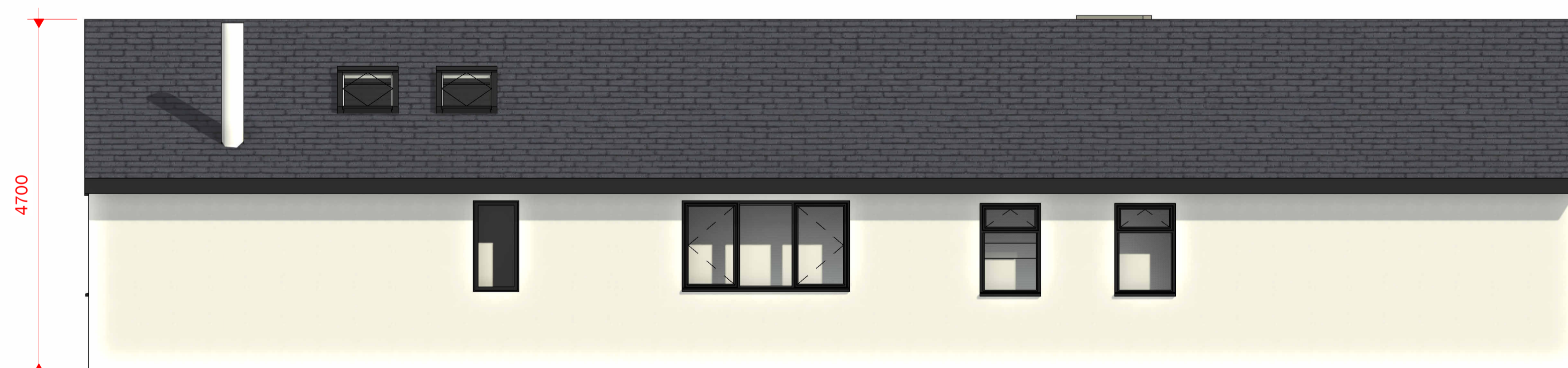
3 PROPOSED SOUTH EAST 1 : 50