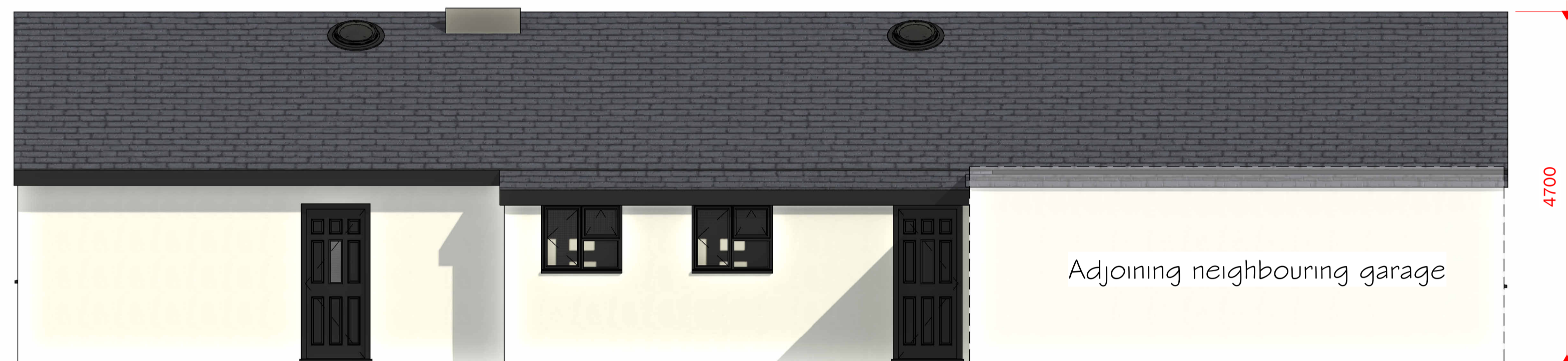
1 PROPOSED NORTH WEST 1 : 50