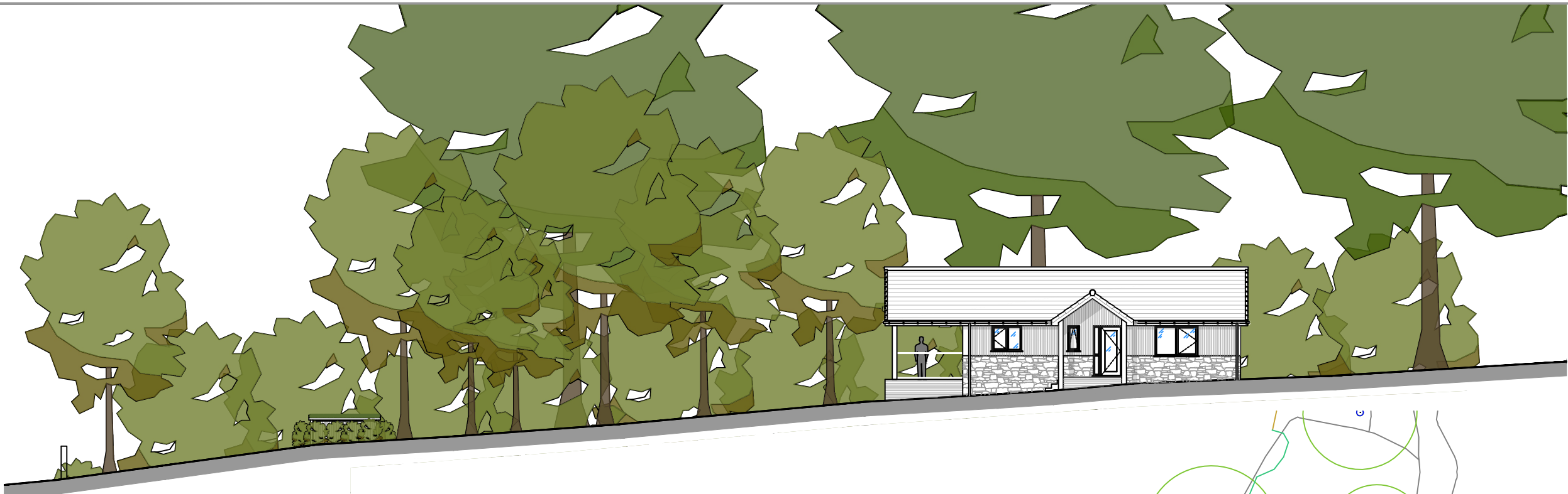
SITE ELEVATION 01 SCALE 1:200 0 2 4 6 8 10m 1:200