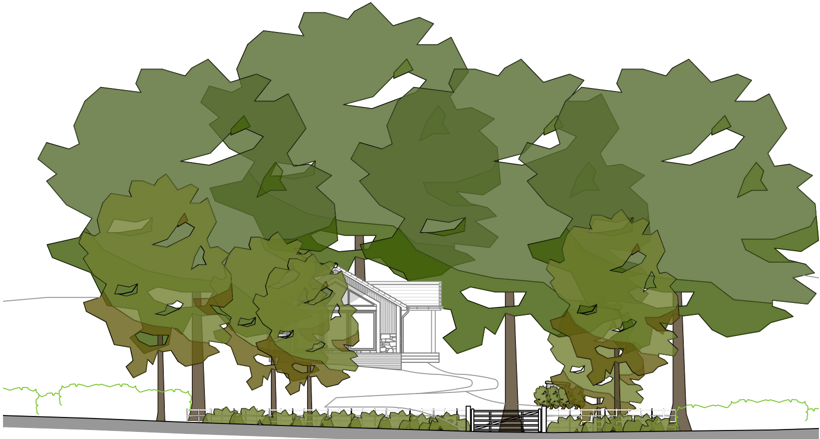
SITE ELEVATION 02 SCALE 1:200 0 2 4 6 8 10m 1:200