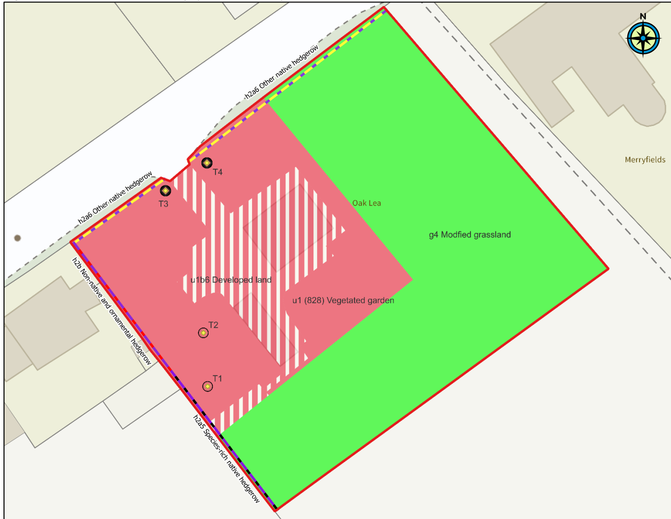
Figure 1: Baseline Habitats Map (Scale – 1:330)