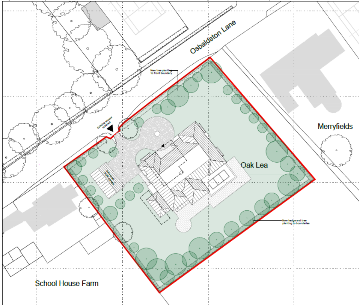
Figure 2: Proposed Site Plan (Rural Solutions, 2025 - Drawing No: 5015-000-03) Scale: 1:1250