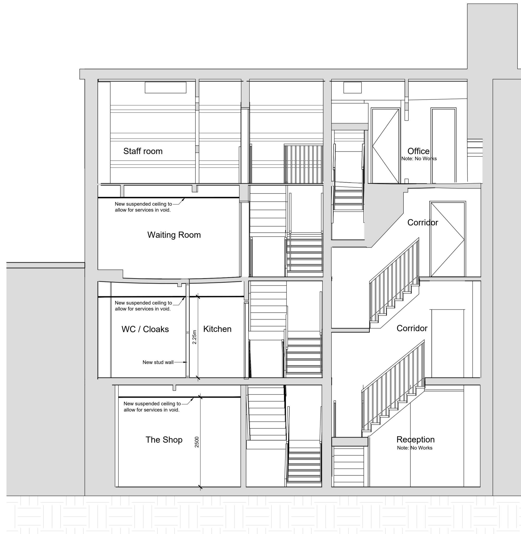
Proposed Section A 1:50 Scale